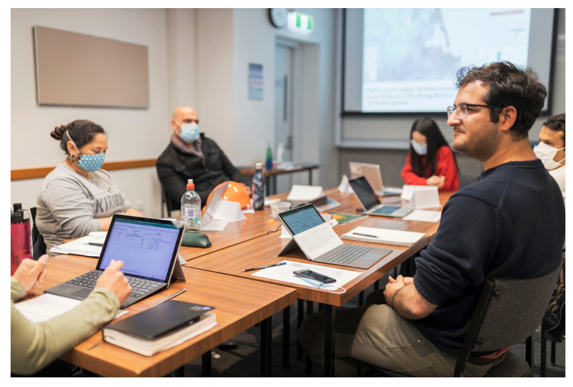
Figure 4. Playing With Uncertainty: Trial exercise with graduate students at the University of Canterbury, New Zealand.