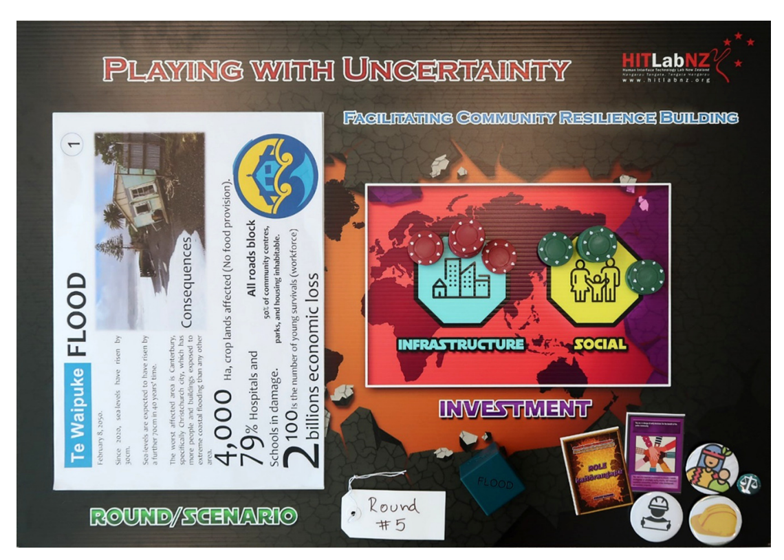
Figure 3. Prototype of table board printed containing all physical elements from the game interacting: Rounds, scenarios, coins, variables, dice, and role-play cards.