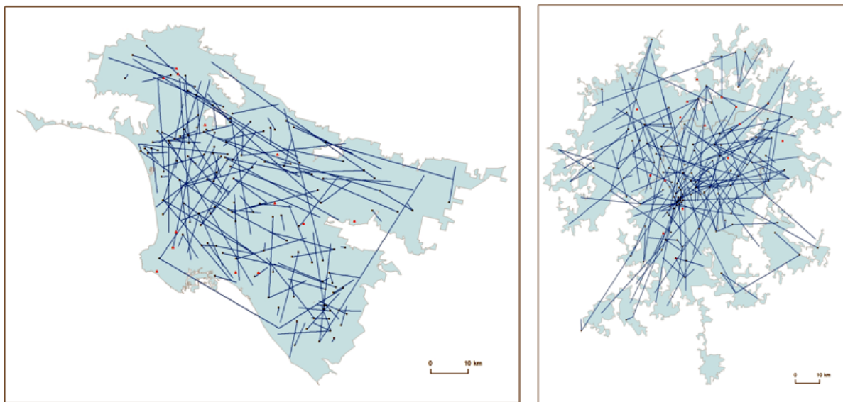
Figure 2. Los Angeles (left) and Atlanta (right) are integrated metropolitan labor markets: People live everywhere and work everywhere.

Large parts of cities need to be recycled and repaired—renovated or torn down and rebuilt anew—