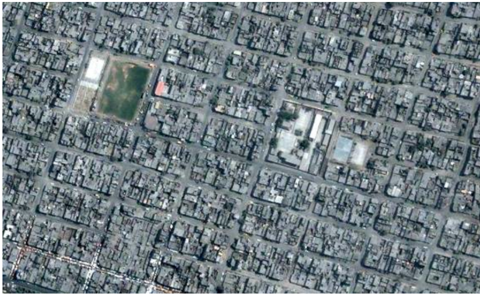
Figure 3. The streets in the Comás squatter community in Lima, Peru, are 10-meters-wide and take up 25% of the area. A 160m 2 house there now costs $180,000.

part, by acquiring the rights-of-way for arterial road grids now, by laying out streets now, and by acquiring lands for public open spaces now.