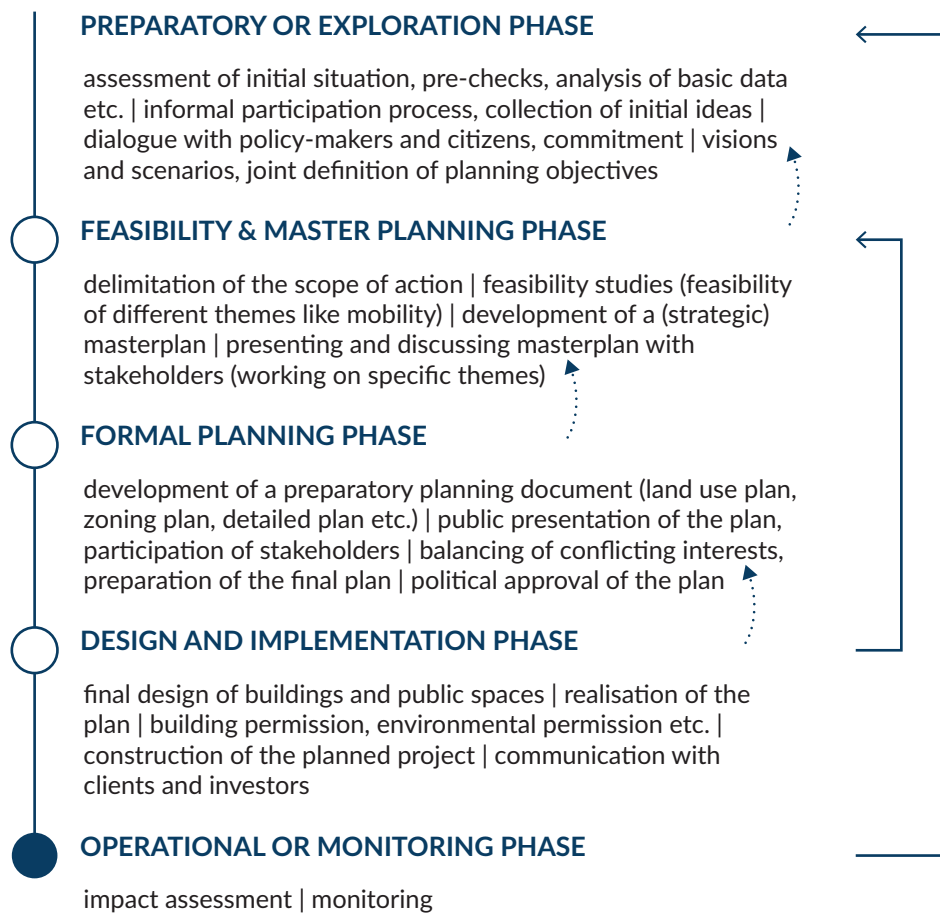
Figure 2. Principal phases of a simplified urban planning process. Source: Own illustration based on Diller et al. (2017) and Urban Learning (2024).

relevant national regulations. This phase includes the participation of stakeholders in public presentations and the balancing of conflicting interests. After the formal plan is approved, the plan will be realized. In the Design and Implementation Phase , the final design of buildings and public spaces will be discussed and determined in accordance with the provisions of the formal plan (Baltic Urban Lab, n.d.-b; Urban Learning, 2024). Then the building permit is issued and the planned project can be implemented or constructed. Continuous and transparent communication is important here to inform the public at regular intervals about milestones in the realisation and progress of a project. Feedback in the Operational or Monitoring Phase can also optimise subsequent planning processes and contribute to more efficient planning. The illustration depicts the phases of a planning process in an idealised and simplified manner. In line with Diller et al. (2017, p. 8), we have chosen a linear model with circular feedback between individual phases, which is often found in practice (see also Baltic Urban Lab, n.d.-a; Urban Learning, 2024).