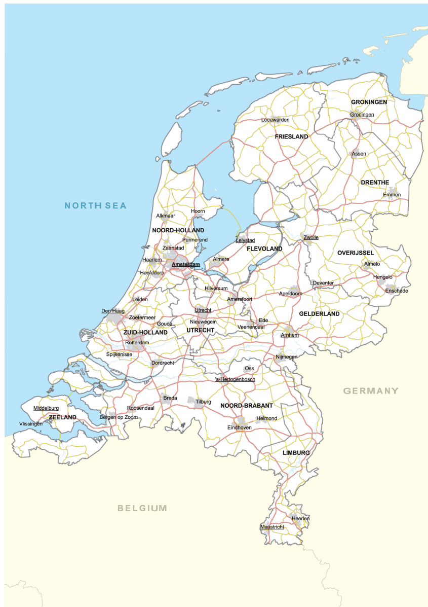
Figure 1. Map of the Netherlands and its provinces.

responsibilities were divided between the stakeholders at different governance levels, and how this changed over time. As will become clear from the analysis, this also involved creating new regional governance arrangements and instruments and/or strengthening existing ones to target shrinkage at the right scale level(s).