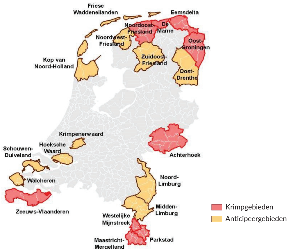
Figure 3. Shrinkage regions ( krimpgebieden ) and anticipation regions ( anticipeergebieden ) in the Netherlands.

The action plan emerged and evolved in times of fundamental economic, societal, and political change, which impacted the plan’s setup and implementation. The financial crisis of 2007–2009 gave a strong impetus to already ongoing trends of neoliberalisation and rescaling in the Dutch government and governance. The Dutch national government was radically reorganised by the right-wing coalition (VVD-CDA) taking office in 2010. A prominent victim of this reorganisation was the Ministry of Housing, Spatial Planning and Environment, which was abolished. Housing became part of the Ministry of Interior Affairs, and spatial planning and environmental policy went to the Ministry of Infrastructure and Environment. This complicated the governance of the Action Plan: the plan was coordinated by the Ministry of Interior Affairs, but the Ministry of Infrastructure and Environment and several other ministries were involved in the plan’s implementation too. The Dutch national government retreated in several policy fields and decentralised tasks and responsibilities to provinces, local governments, and other regional governance arrangements; and non-governmental actors and organisations were expected to take more responsibility in societal development. A “participatory society” was encouraged in which citizens were supposed to care for each other and to be more self-reliant and less state-dependent (Ubels et al., 2019).