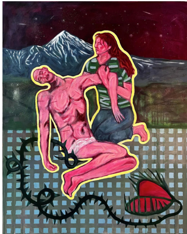
Figure 3. Zartosht Rahimi, For All the Martyrs of Freedom, on saving the world with art , 2022.

Shahsavari and Ayeen's artwork stands as a potent critique of the Iranian government's actions, and it is instrumental in unveiling the emotional turmoil experienced by many Iranians. They employ evocative visual techniques in their gouache and watercolor artworks, capturing the complexities of the Iranian socio-political landscape and the emotional weight of living within it. Through their poignant pieces, they communicate not only personal emotions but also a collective sense of grief and frustration, thereby aligning their expressions with broader social narratives (see Figure 4).