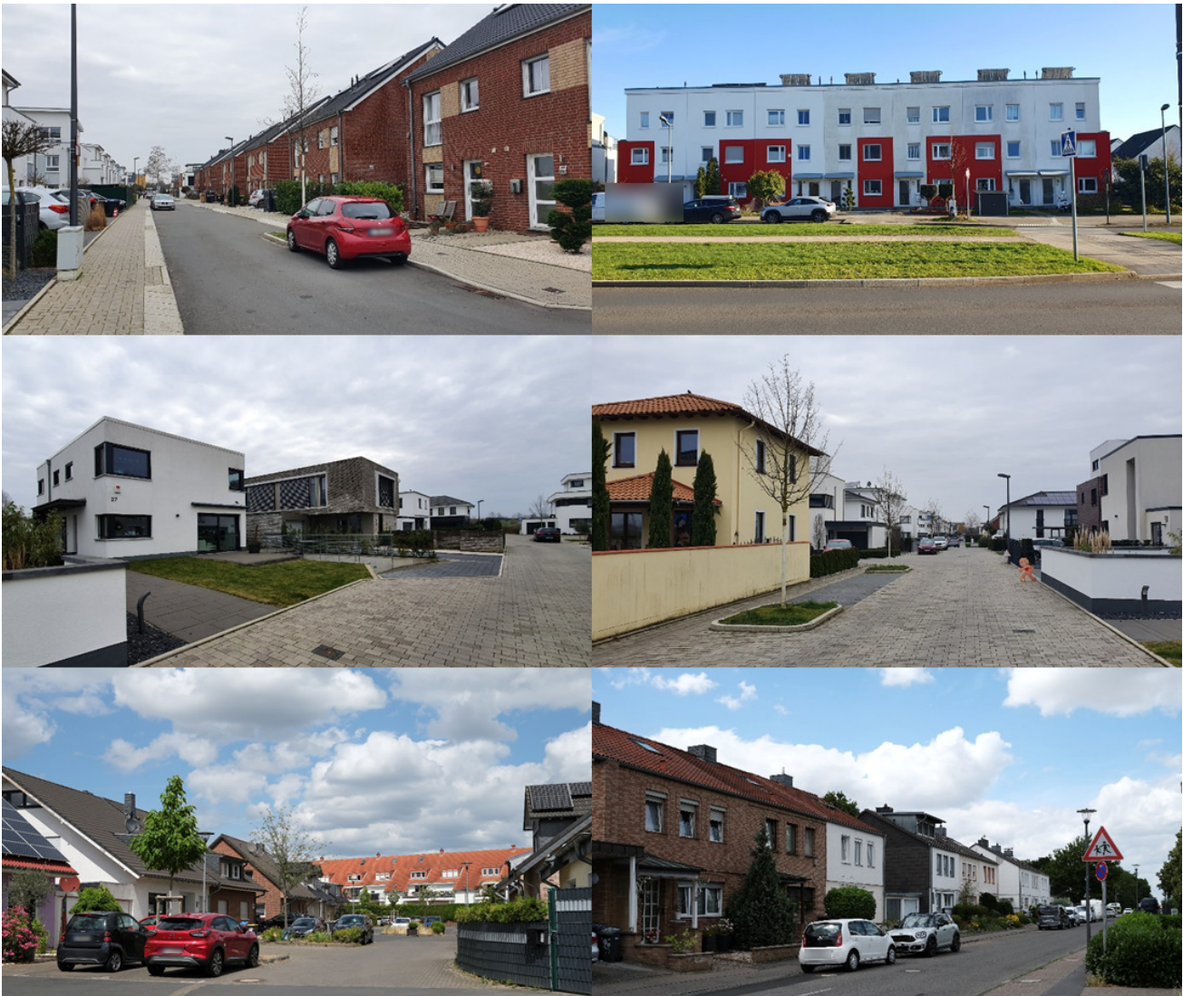
Figure 2. Examples from Widdersdorf-Süd (top four) and other parts of Widdersdorf (bottom two).

Commuting to work is a good example of a daily routine related to mobility that can be a struggle for those living in Widdersdorf. Regarding the built environment and especially the transport infrastructure, there is often no practical way around driving a car to work. While an expert from the City of Cologne describes car use as part of today's Lebensinzenierung (life staging), the interviewees have a different perspective. Interviewee 1 (Household B) explains: