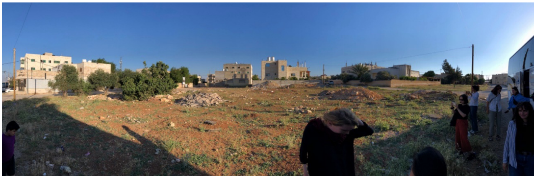
Figure 3. Public park in Assarih before intervention.

One important characteristic of these activities was the presence of students who spoke the mother tongue