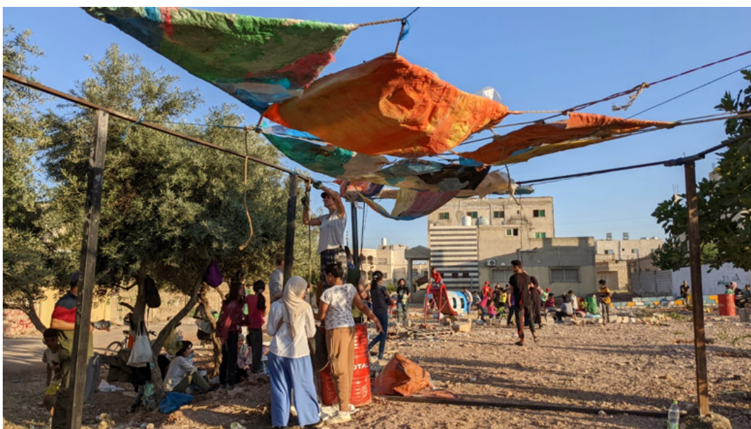
Figure 4. Public park in Assarih after the intervention.