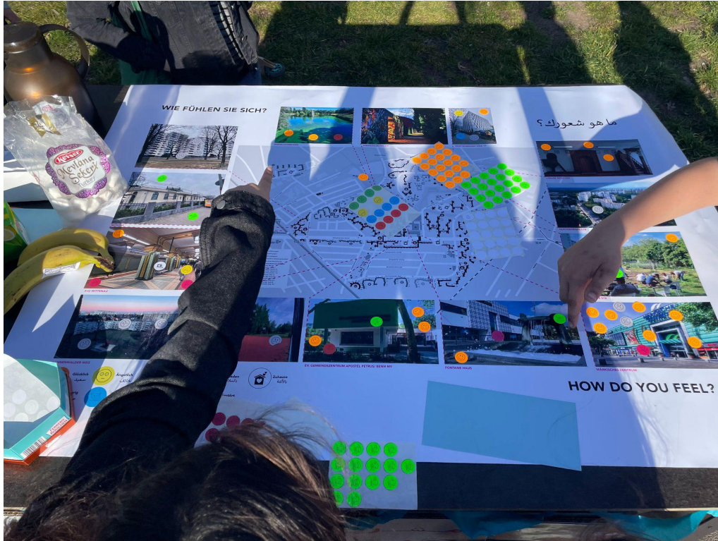
Figure 1. Map of emotions in Märkisches Viertel, Berlin.