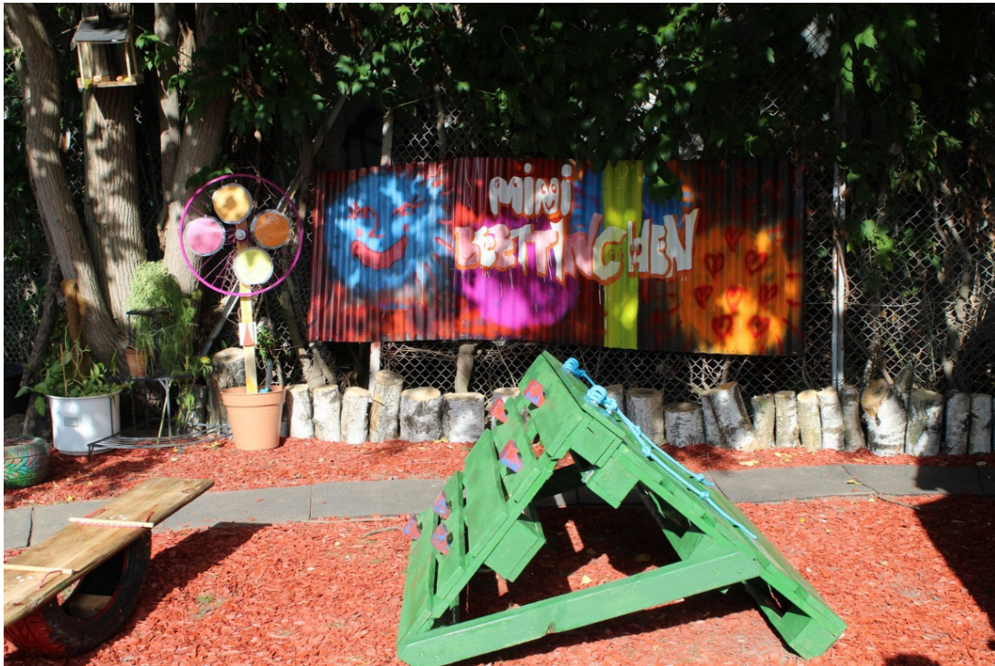
Figure 5. Playground after intervention at Beettinchen, Märkisches Viertel.

of the majority of the refugees and who acted as mediators between the students who did not speak the language. Although we relied on non-verbal tools, it was important to offer the possibility of creating dialogues in their native language and, most significantly, with others who shared a similar culture and background. We wanted to obtain information and perceptions from the residents that went beyond such techno-pragmatic issues as, for example, lack of access to housing, language skills, or income problems.