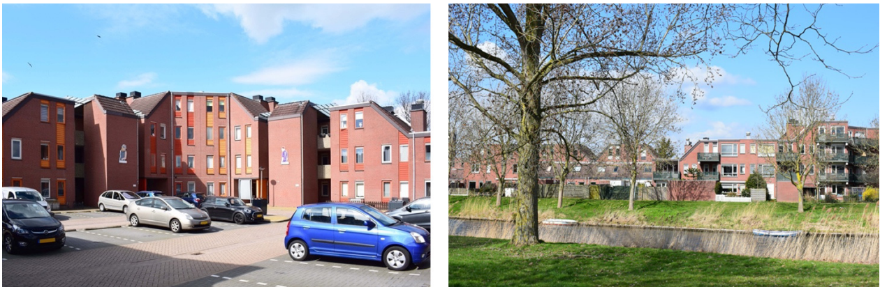
Figure 1. Residential yard ( woonerf ) in Goedewerf (left) and surrounding area of Goedewerf (right).

mostly low-rise neighbourhoods. The urban plan for its centre refers to the traditional Dutch city with urban attributes like canals, canal houses, and narrow street profiles. The Goedewerf residential complex was designed by the architectural firm INBO and dates from the 1970s. It has a woonerf character, which involves traffic-free courtyards, clustered parking, private garages, a collective green area, and a playground in its centre (see Figure 1). The aim was to create an enclosed semi-public courtyard geared for use only by local residents. The architects aimed to avoid a smooth facade wall but envisaged human-scale dimensions and a diversity of balconies, loggias, stairwells, and galleries (Rijksdienst voor de IJsselmeerpolders, 1976, p. 1). The residential complex consists of diverse dwelling typologies and sizes, combining single-family houses and flats. The facades are in red brickwork complemented with various materials and colours, including wooden window frames, balcony railings, various panelling, exposed concrete lintels, and gravel concrete elements. Due to the organic shape of the block and the sloping roofs, the roof shape is complex. The houses in Goedewerf are partly owned by private homeowners and partly by social housing corporations.