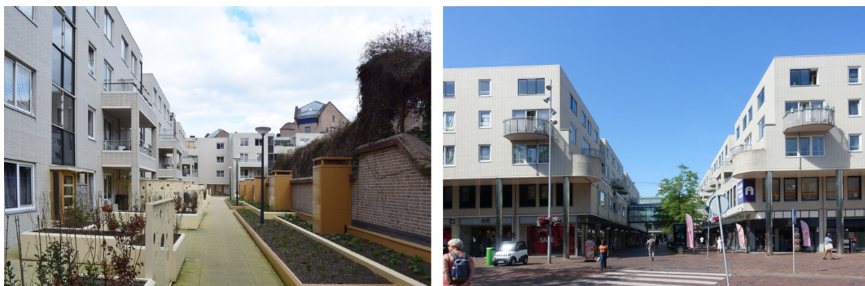
Figure 2. Residential deck ( woondek ) in Bijlmerplein (left) and public square in Bijlmerplein (right).