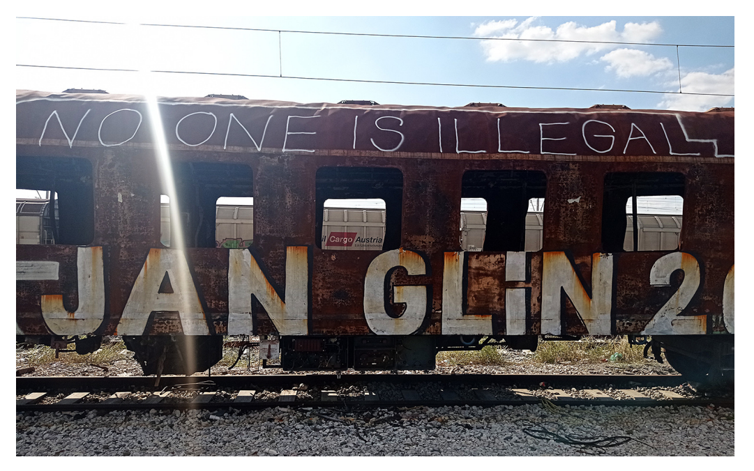
Figure 7. Graffiti in the abandoned train wagon on the west side of Thessaloniki. On the backside, an Austrian freight train can be seen. At the time of the photo, a group of people jumped on it to continue their journey to the next countries.

(2015, p. 91), "borders and boundaries...not only divide, but also join them together." In our case study, we confirm lossifova's argument as the multiple enclaves of abandoned train wagons in West Thessaloniki are transformed into interconnected arrival infrastructures for the people on the move. At the same time, we can extend lossifova's argument as on a larger scale, the borderland of abandoned train wagons constitutes a stopover point and a joined node in the long journey of people on the move. Admittedly, the urban borderland of the abandoned train wagons is in constant dialogue with the border security policies and cross-border mobility potentialities. Actually, the borderland of abandoned train wagons is a site of arrival and departure as it connects the routes of people on the move from Turkey to Thessaloniki and then to the next Balkan countries (see Figure 7). The testimonies of our research participants unveil that the borderland of abandoned train wagons is like a "porous membrane" (Stavrides, 2016, p. 69). It is not only a crucial connection to the linear route of people on the move from Balkan countries and have come back to Thessaloniki. They recover and then they try to continue their journey again and again in the ongoing struggle to cross borders.