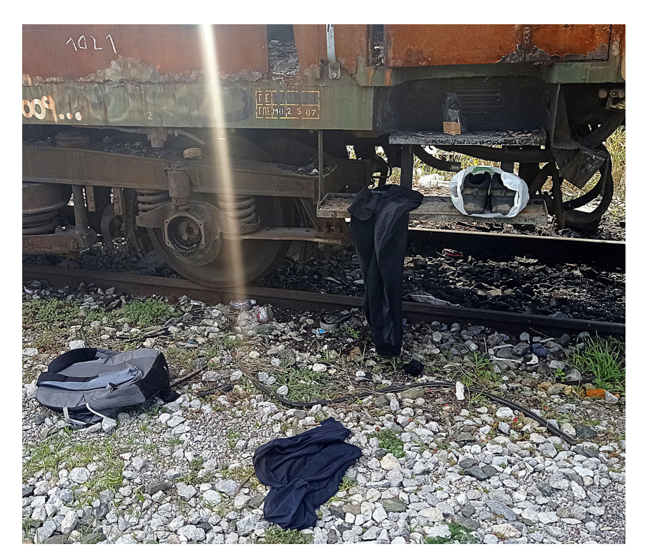
Figure 6. Bag, clothes, shoes, and biscuits left in an abandoned train wagon by migrants who have left, and that will probably be used by the next people on the move.

I think that when you are on the move, when you seek to find a safe country and a better life, you are more open to learning and experiencing new worlds, new cultures, new perceptions. It is possibly an unconscious choice, but it happens. The movement opens up new perspectives that you did not imagine. It is the moment of your life when you are possibly more open than at any other time. You can more easily create relationships with other people, relationships that would have seemed unimaginable to you before starting your journey.