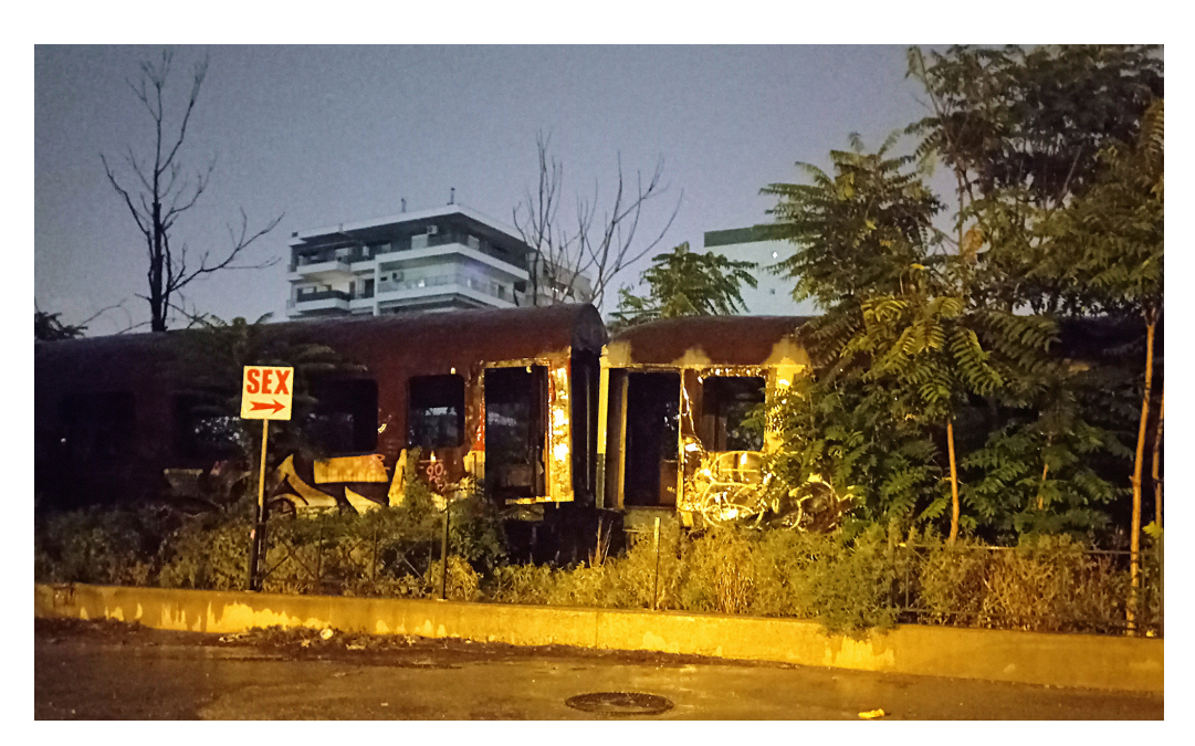
Figure 3. Abandoned train wagons next to the red light district (the sign indicates the direction the red light area is located).

Also, in the words of Said from Morocco, who is living in the abandoned train wagons: