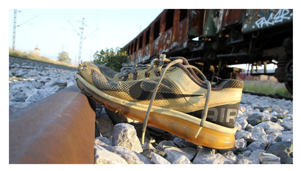
Figure 5. Shoe left on the rails next to abandoned train wagons.

blanket on top. You have to be careful, the wagon is rusty, it has holes in some places, and especially at night without light it is dangerous. We have made this here like a room, we sleep close to each other. We sleep seven people here. Some nights some can't sleep, they are usually newcomers and they have nightmares, then the rest of us try to calm them down. We need to support each other, otherwise, it's very difficult.