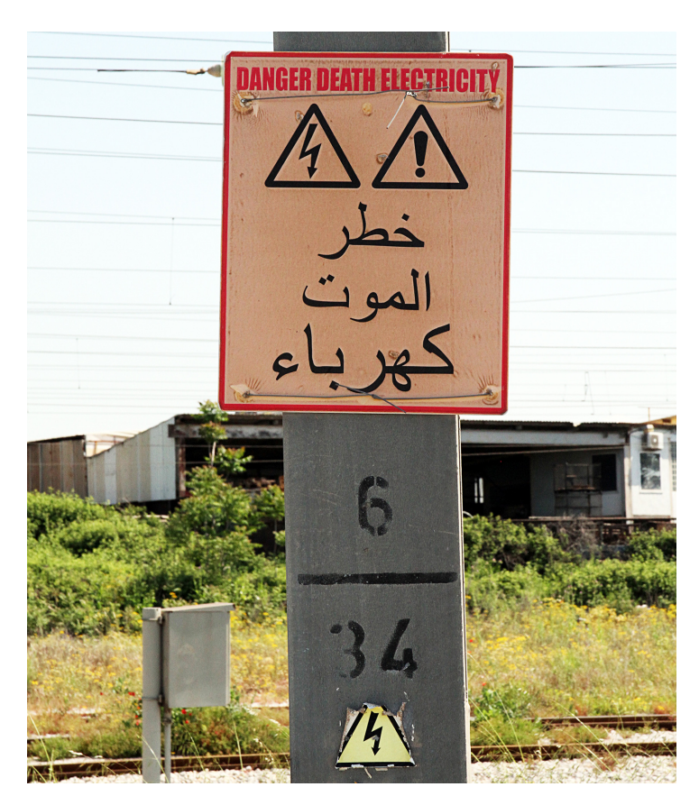
Figure 4. Sign in the area of the abandoned train wagons written in Arabic and English warning migrants trying to pass the railway lines that it is dangerous because of electricity.