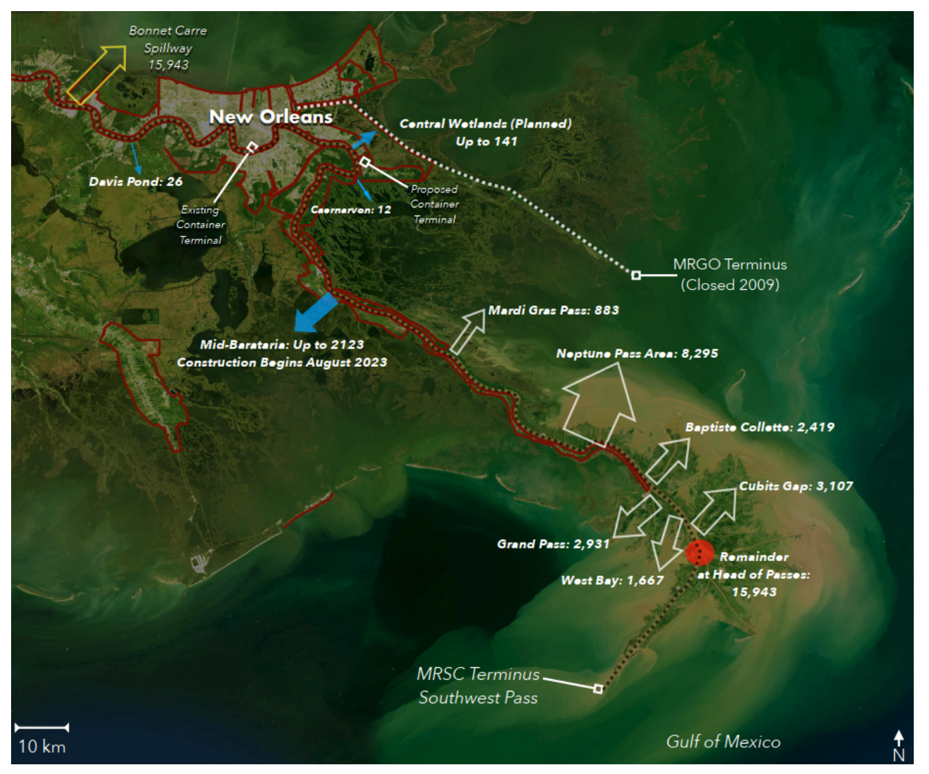
Figure 1. Porosities along the MRSC during the 2019 flood. Notes: The black dashed line shows MRSC; the white dashed line shows the route of Mississippi Gulf Outlet (MRGO); the red lines show flood protection levees; the yellow arrow shows flood control spillway; the white arrows are naturally occurring channels or outlets; the blue arrows are existing and planned coastal restoration projects; the arrow size represents approximate relative flow rates; the red dot indicates Head of Passes; all flows in cubic meters/second; the water losses were measured on March 10, 2019, during a maximum flow scenario below Bonnet Carre Spillway (40918 cm/s at Tarbert Landing).

waterborne transportation. The disturbance regime concept is intended to capture the varying ways that the frequency and magnitude of disturbances like floods, fires, and droughts undergird broad-scale ecological patterns (Turner, 2010). For example, levees designed to prevent overbank flooding along the MRSC deprived deltaic wetlands of freshwater and sediment input, contributing to staggering rates of land loss and compromising ecosystem function and resilience in the region (Edmonds et al., 2023). This demonstrates how infrastructural zones can modulate disturbance regimes, altering the historical range of variability that previously determined landscape-scale environmental dynamics. In response to the unintended consequences of these changes, hydrocracies are being called upon to implement so-called