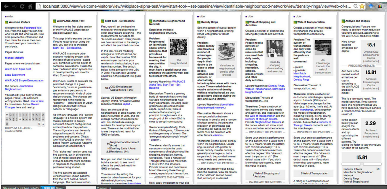
Figure 1. The overall structure of the WikiPLACE urban design scenario-modeling tool, as it appears in a screenshot of its maximum zoom out on a desktop, showing all the patterns used in the alpha test version. From left to right, the introduction and startup page, the Start Tool—Set Baseline page, the four patterns, and the final display page. Users can adjust the values of the patterns, or change the order or number of patterns. Following the protocol of a wiki, users can also edit the patterns as they desire, or even write new ones on their own local copy, which can be shared with others, if desired, through the federated network.

The paper, by molecular biologists Stuart Newman and Ramray Bhat of New York Medical College, considers the mystery of the origins of multi-cellular organisms around the time of the so-called Cambrian Explosion, approximately 550 million years ago. They propose that something analogous to a pattern language structure occurred in the genetic code. As they explain in the abstract: