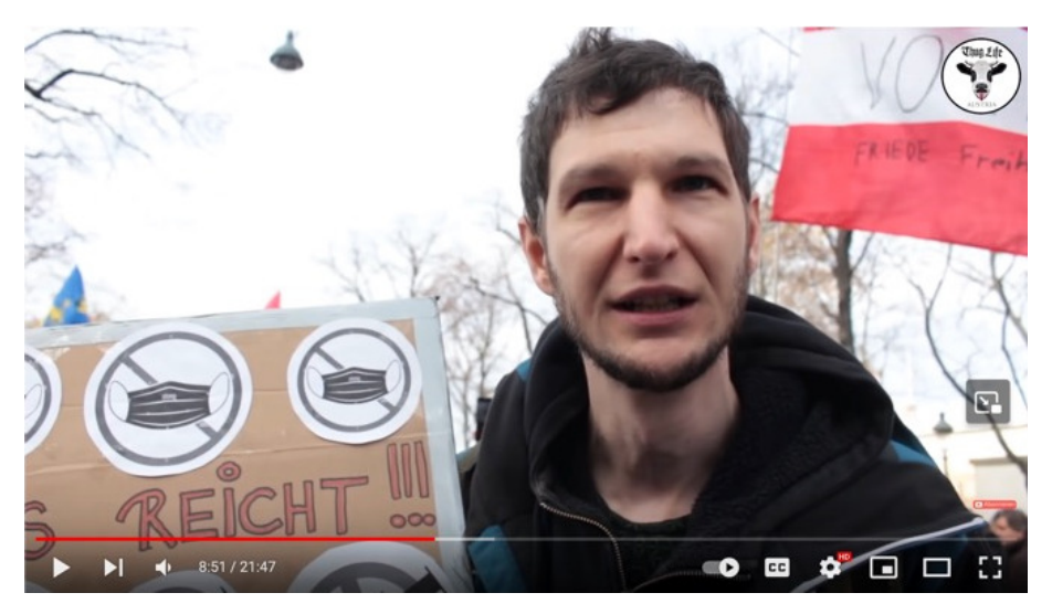
Figure 3. Original quote in German: "Die Impfpflicht...das ist mein Körper und ich möchte selbst entscheiden, was ich mit meinem Körper mache...dieses Argument mit der Solidarität...ich kann das nicht nachvollziehen, wie gesagt, es ist mein Körper es ist mein Grundrecht selbst zu entscheiden was ich mit mir oder mit meinem Körper mache" ("The mandatory vaccination...it's my body and I want to decide myself what I do with my body...this argument with solidarity...I can't grasp that, as I said, it's my body it's my fundamental right to decide myself what I do with myself or with my body"). Source: Thug Life Austria (2021, 08:30).

bodily empowering stance against that perceived threat. Since there is no natural need for such discomfort and protest to turn towards the populist right-wing over time (Brunner et al., 2021, p. 54), the workings of neoliberal subjectivity might be added for interpretation. By this