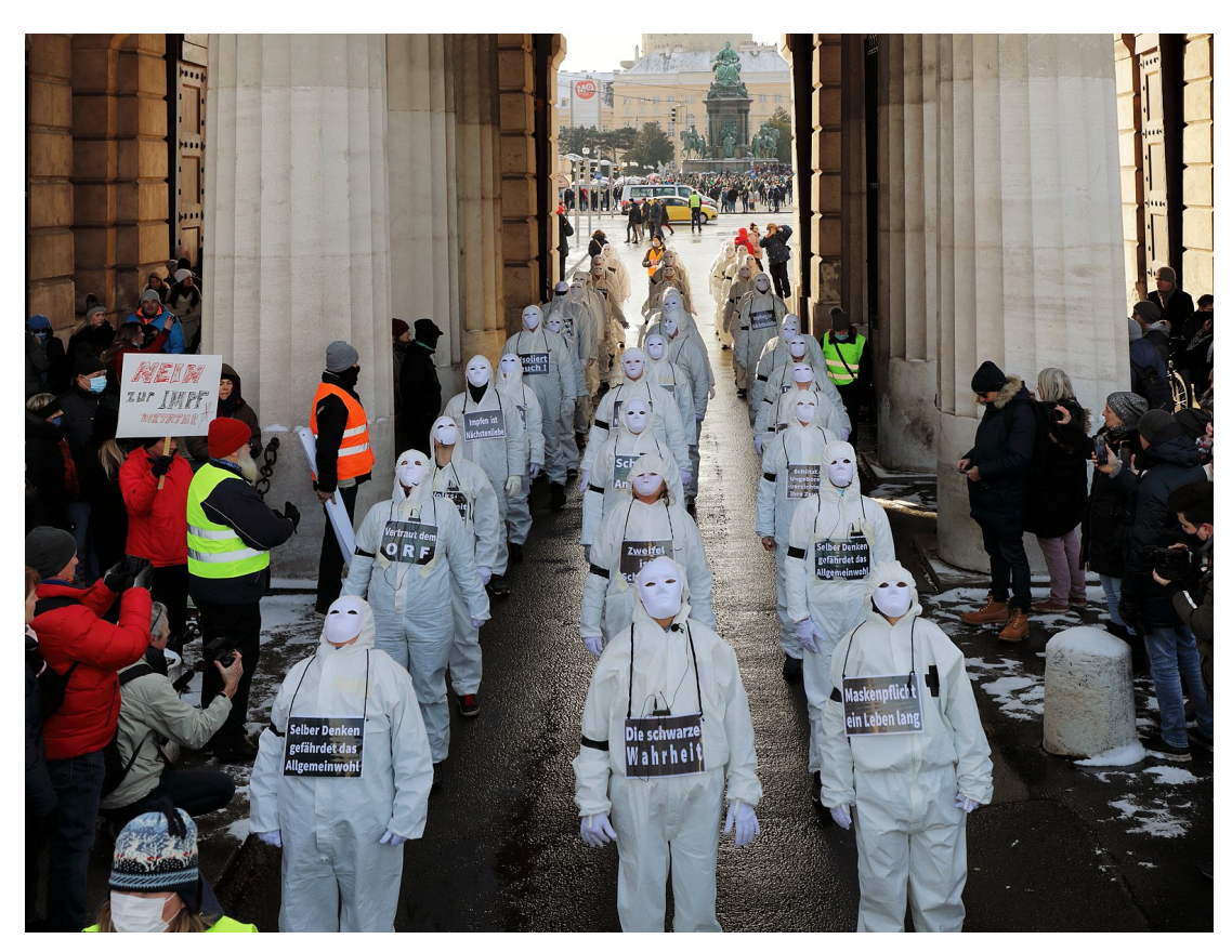
Figure 2. Vienna: Anti-corona demo, performance group with protective suits.

perceived loss of bodily sovereignty (see Brunner et al., 2021, p. 42). This was intensified in the ongoing debates around compulsory vaccination, which in turn provoked deliberations on the relationship between the self and the body, producing protest as a (self-)defensive and