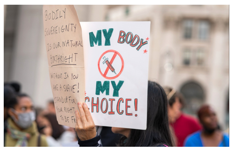
Figure 1. "My body, my choice": Feminist slogans in anti-restriction protests.

As political counter spaces gained momentum, Wahidie et al. (2021) identified that many of these quite diverse anti-restriction protesters share a strong orientation towards information distributed via digital media technologies such as messengers (e.g., Signal, WhatsApp, among others) or platforms (e.g., Youtube, etc.) often used in combination. Much of this new type of political resistance has become intertwined with highly selective social media channels in which the quality of information can often not be publicly monitored. In this respect, "an important feature of such anti-vaccine...protests across the globe is a surge of [d]isinformation" (Liao, 2022, p. 1, referring to Ahinkorah et al., 2020) that is "strategically manipulated and circulated with a clear purpose to cause socio-political unrest and disruption" (Das & Ahmed, 2022, as cited in Liao, 2022, p. 1). The expansion of artificial intelligence and certain algorithms has eroded and distorted the public realm as that sphere where public opinion is ideally formed through open dispute and debate (Fraser, 2008). Instead, Eberl et al. (2021, p. 6) have stressed the role played by the unfiltered dissemination of false information on secured