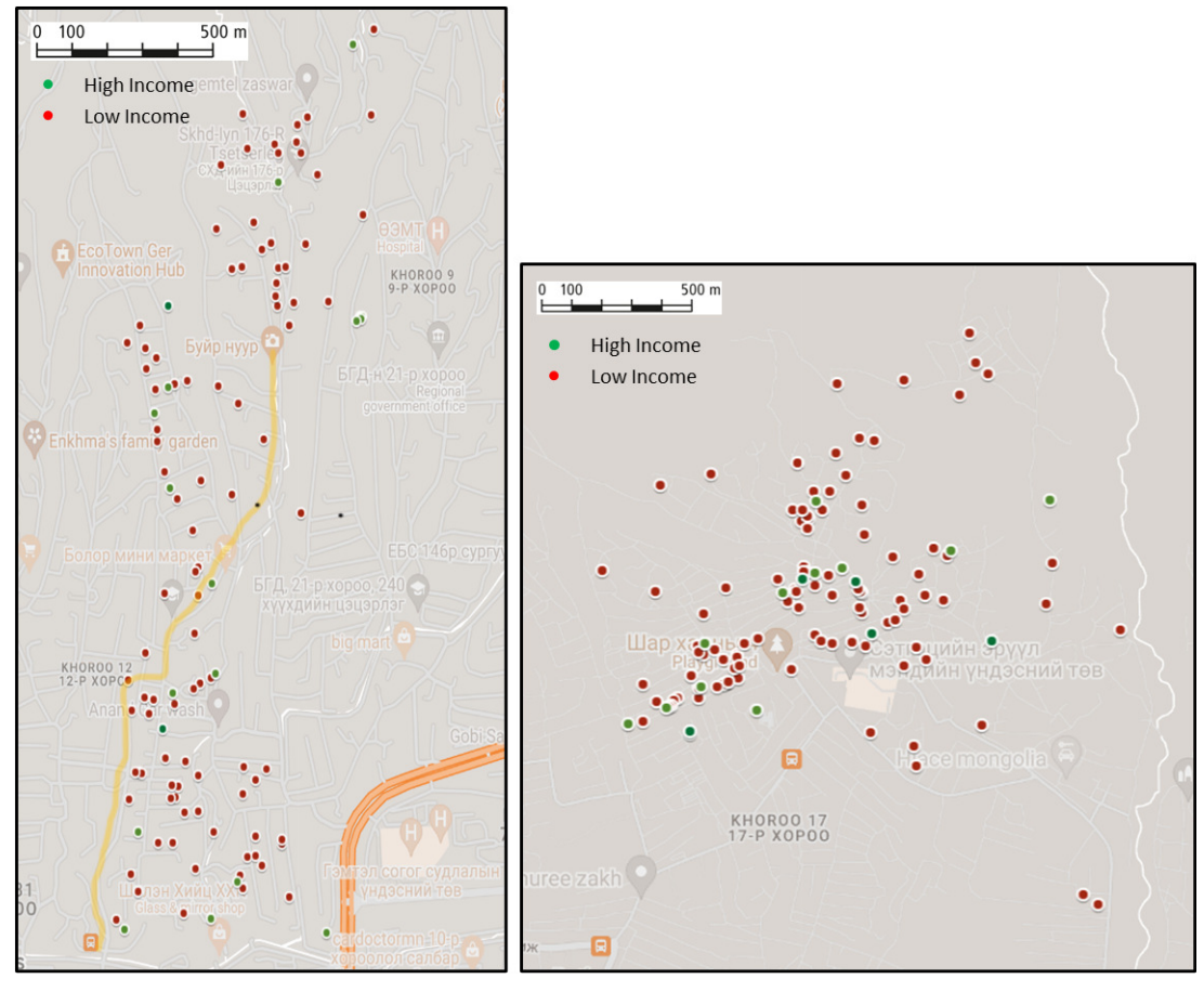
Figure 2. Disposition of low- and high-income households in SKD-31 (left) and BZD-9 (right).

significant differences between commuting by car and by public transport is in the very different journey times between the commutes.