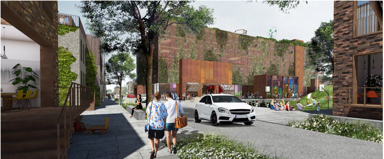
Figure 5. Neighborhood square with mobility hub: Visualization for Oberbillwerder.

a concordance of interests between design and mobility demands.