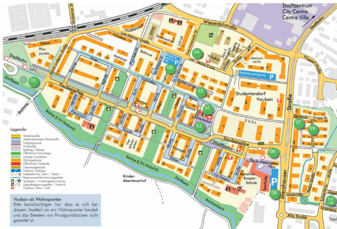
Figure 1. Vauban overview map.

Copenhagen serves as a different role model (Freudental-Pedersen et al., 2020; Herrmann et al., 2021). The approach thereof combining a garage with playgrounds—and this with a rather extroverted architecture—attracted attention, even if the object is a unique piece and as such not easily scalable for housing development. The building itself, called Park'n'Play, is an ordinary parking garage in terms of its structural design but has a public play and sports area on the roof, which is accessible via a curtained staircase structure. In addition, an outstanding façade design ties in with the historic use of the harbor. Nevertheless, in Germany's new development areas, high-quality green spaces with sports and play facilities are provided anyway, so there is no need to resort to garage roofs for this purpose as in the cramped situation of the inner city. The inspiring moment of the design rather results, on the one hand, from its multifunctional usability and, on the other hand, from the horizontal linking with curtain wall uses, which