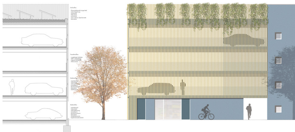
Figure 6. Garage building visualization for Buckower Felder in Berlin.

At first glance, this counteracts severely with outlandish design schemes, the Copenhagen example, but also