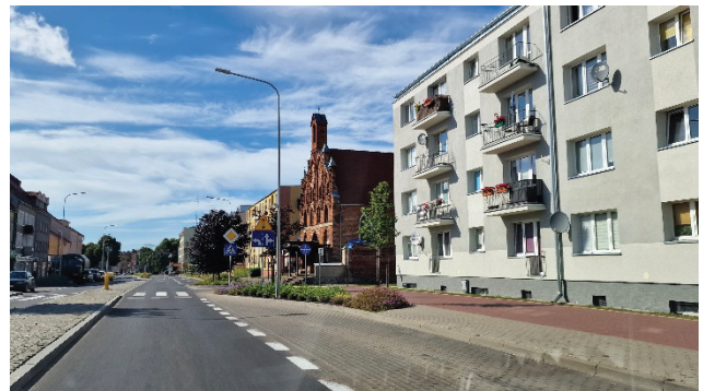
(b) Braniewo: Kościuszki Street