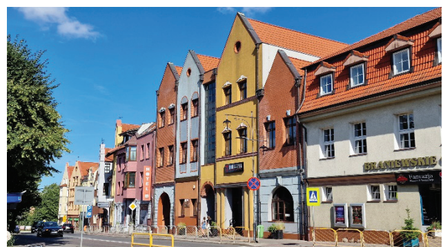
(d) Braniewo: New complex in the vicinity of the Cathedral Church