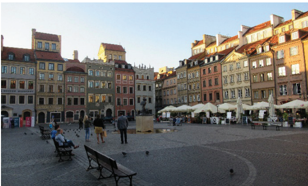
(a) Warszawa: Old Town Market

Although, paradoxically, this specific concept of post-war reconstruction—defined as a means of restoration of the centre of national identity, the Old Town of the Polish capital—was also used to recreate the centres of former German cities such as Wrocław (Czerner, 1976; Małachowicz, 1985) and many others, including Gdańsk (Massalski & Stankiewicz, 1969; Stankiewicz & Szermer, 1959; Szermer, 1971; Figure 2), it was applied to very