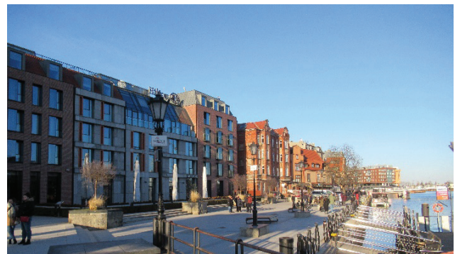
(b) Gdańsk: Long embankment