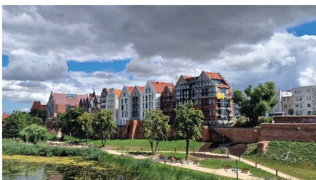
(c) Malbork: New complex in the forefront of the Old Town