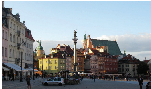
(b) Warszawa: View of the Old Town and Royal Castle Square