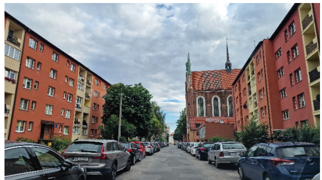
(d) Gdańsk: Rzeźnicza Street