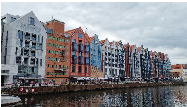
(a) Gdańsk: Granary Island