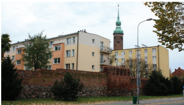
(c) Słupsk: Old Town as seen from Jagiełły Street