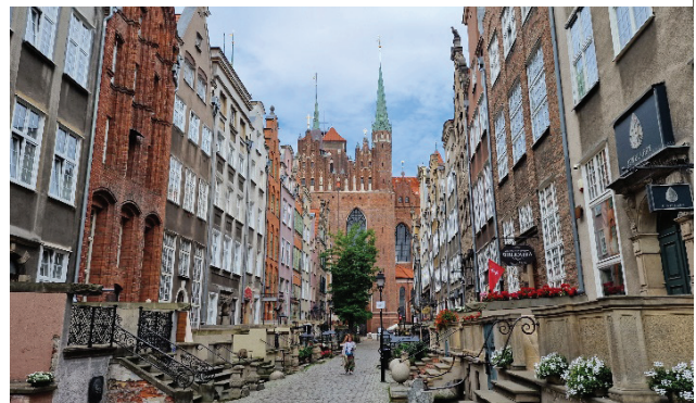
(d) Gdańsk: Mariacka Street