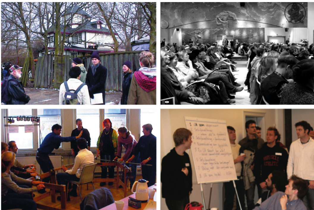
Figure 2. Elements of the Christiania conference. From left to right, top to bottom: Guided tour, trial, “jury deliberation,” and “verdict.”