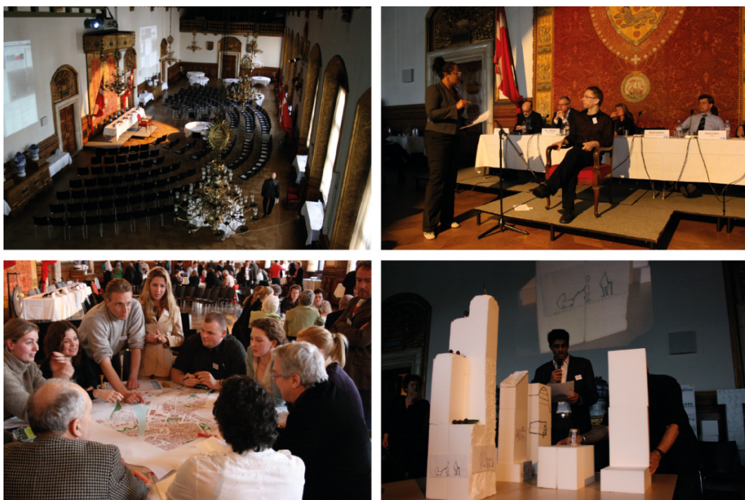
Figure 5. Elements of the hearing on the high-rise strategy. From left to right, top to bottom: Trial scenography, “cross-examination,” “jury deliberation,” and “verdict.”

Most of the artistic approaches to participation work through the creation of an atmosphere for the participants of autonomous creativity beyond the control of established interests. One of their main defects is their lack of attention to the fact that it is still in a field within the control of these interests, “the structural norm” (Turner, 1982, p. 47), that the possibilities of the liminoid visions are realized. The explicit objectification of power in Free Trial! makes this paradox clear—and