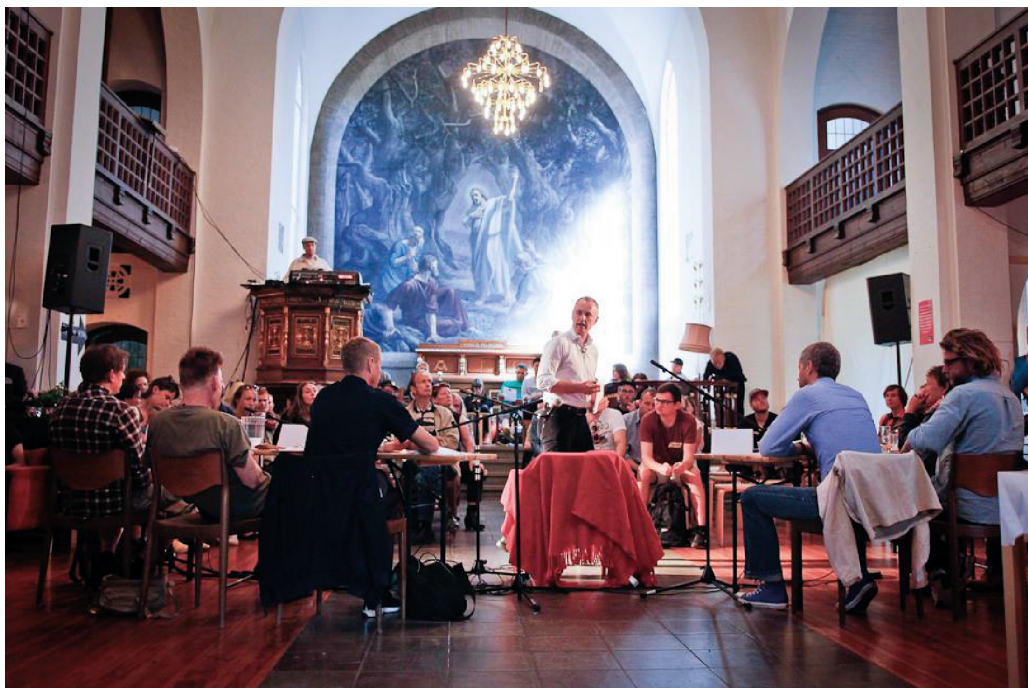
Figure 3. An advocate challenging a witness during a Free Trial! on social inclusion in May 2014.

Whereas the insights from these set-ups have been hugely different, the most important of these insights came from the potential of the concept as a tool of power analysis—a tool unearthing the immanent workings of power both among different political agents of the city and between these and the group of facilitators organizing the Free Trial!. The most crucial reenactment of the format was the one dealing with a formal, public hearing