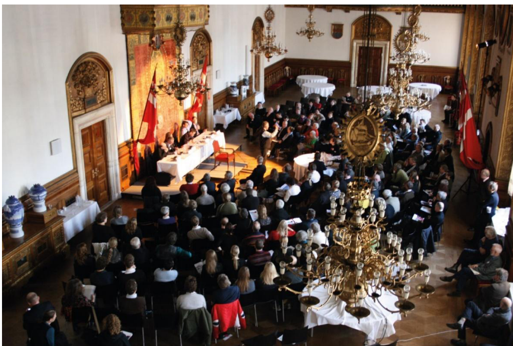
Figure 4. Free Trial! in the ceremonial core of the Copenhagen town hall: Hearing on the high-rise strategy in March 2007.

Still, the hearing was realized more or less according to the reduced plan as an open event for citizens of Copenhagen and in accordance with the dramaturgical