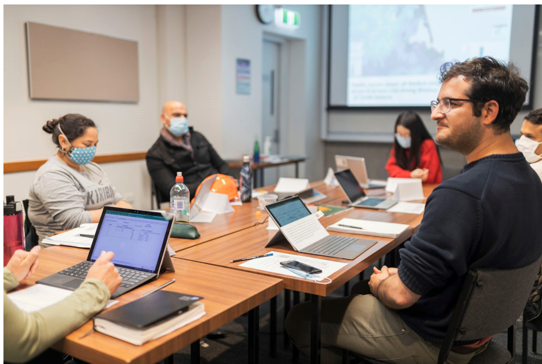
Figure 4. Playing With Uncertainty: Trial exercise with graduate students at the University of Canterbury, New Zealand.