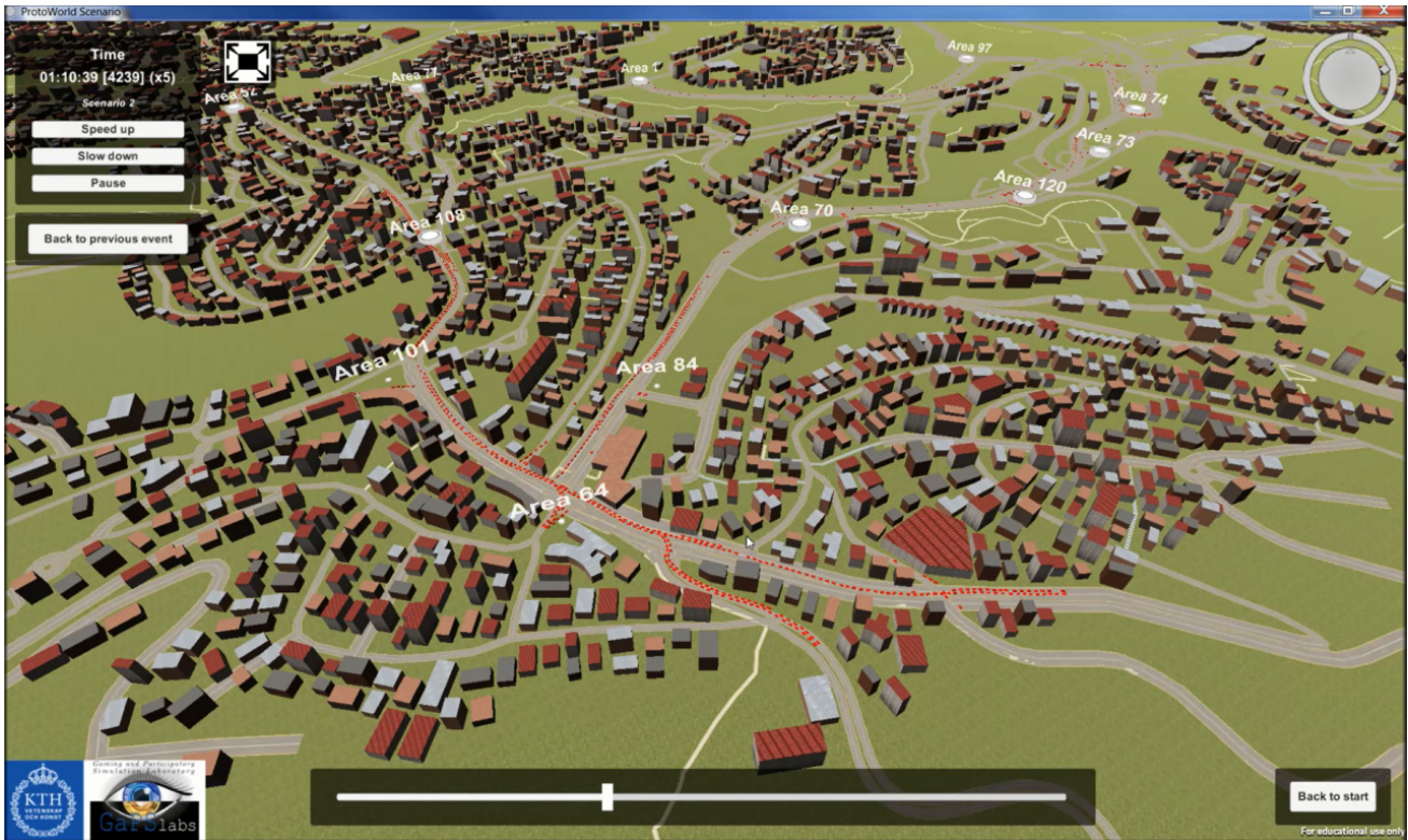
Figure 2. Macro view of the game in Haifa.