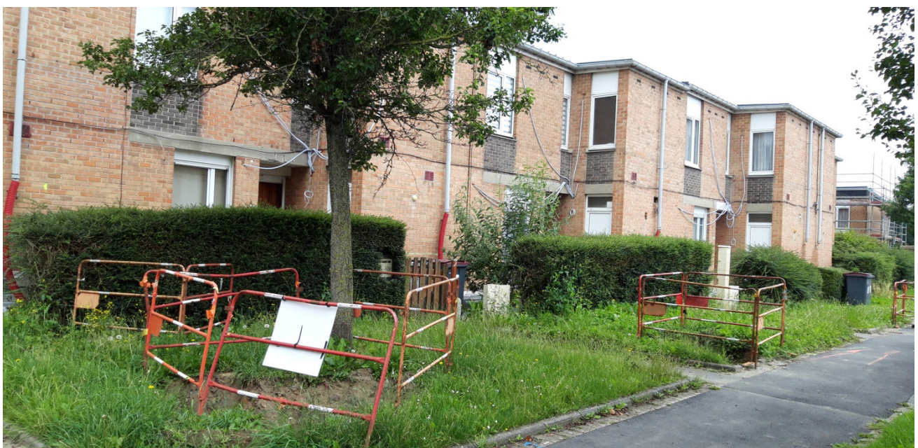
Figure 4. Public space affected by energy network upgrade in Wattrelos.

While some companies apply the learning by doing and treat this complexity as an opportunity to develop the business and their skills in working on an occupied site, others fail to cope with the challenge. As a result, the quality of the work and the relationship with tenants are compromised, and the landlord and contractors tend to blame each other for the failure (interview with the project representative of a Dutch construction firm). In addition, our interviews reveal the lack of foresight, on the part of both the landlords and the occupants themselves, about the upheaval produced by the speed of the spatial changes during the work: “At certain point when