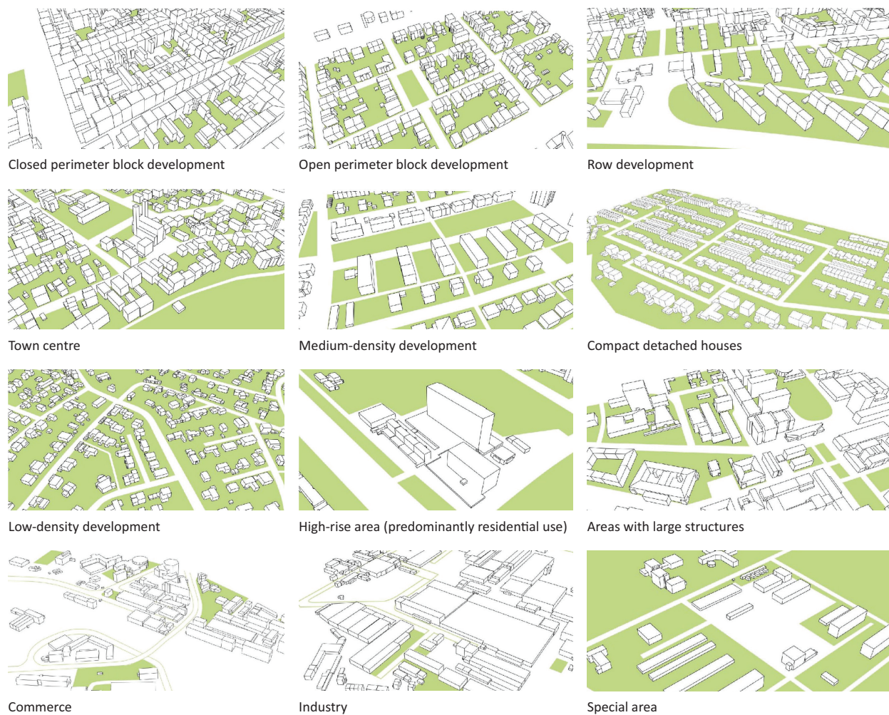
Figure 2. Major urban structure types in Karlsruhe.