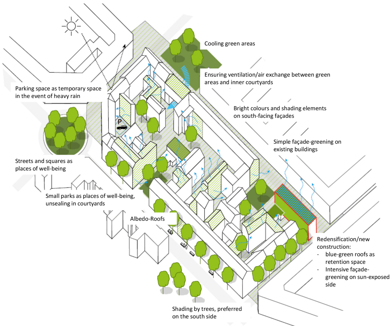
Figure 1. Potential adaptation measure for a compact perimeter block development proposed in the urban development plan.

structure types (Figure 2). A multi-criteria analysis combined the structural characteristics of the neighbourhood with human and societal characteristics, with the latter giving some hints on aspects of human vulnerability (Section 4.2.2). The urban adaptation strategy anticipates that nine of the 12 structure types will require adaptation measures by 2050 because of their relatively high vulnerability metrics (Beermann et al., 2014). The structure types are grouped into three classes (Table 2): medium to high climatic stress, low to no climatic stress, and low exposure to heat stress. These refer to different levels of concern and demonstrate differential adaptation needs to climatic hazards.