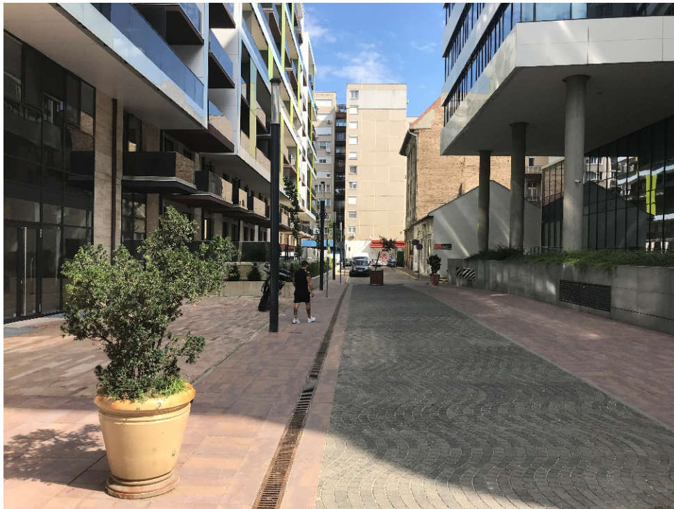
Figure 4. Urban diversity of the Szigony area: New residential buildings, prefabricated modern slabs, and historic tenements in the background.

The use of ICT and digitalization has opened new perspectives for urban planning and development worldwide. In the following section, we review the contemporary planning shaping the physical and social context of the Szigony Street area based on fieldwork and surveys undertaken with planning and design professionals in 2021.