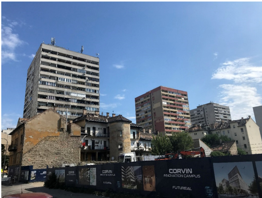
Figure 2. Budapest's Szigony Street.

The urbanization of the site begun in the 1730s with the construction of the first buildings. This eastern outskirts area of Pest City received the name József (Josephinum) after the son of Maria Theresa, the Habsburg sovereign of Hungary, in 1777. The first plan defined the main roads and large urban gardens. After the unification of