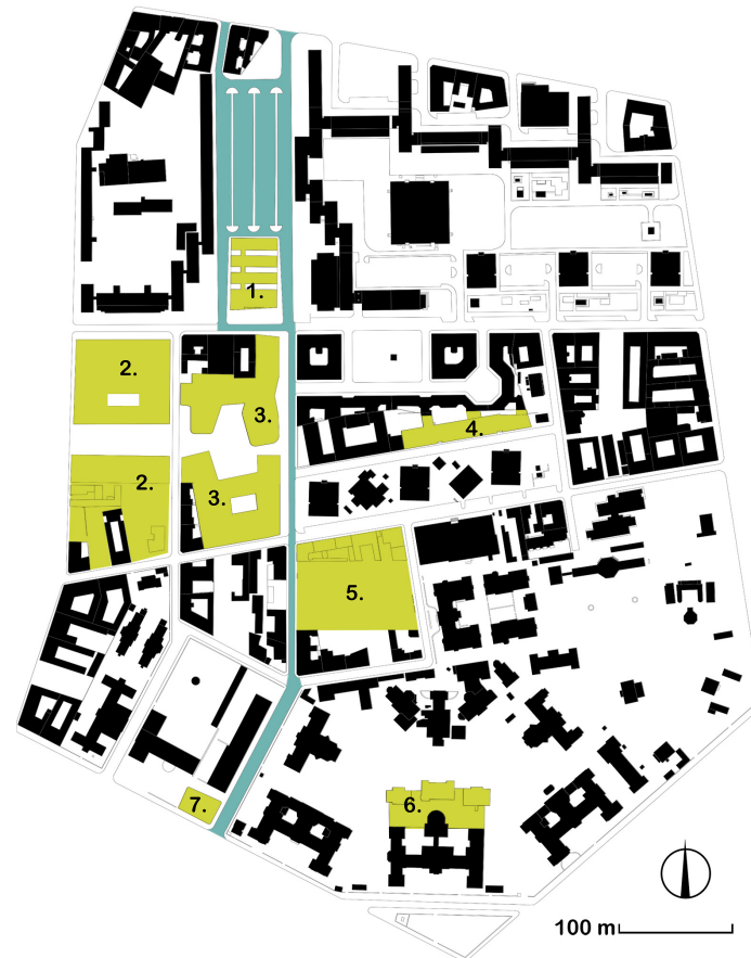
Figure 6. Contemporary large-scale development and design units. Legend: Corvin Street (blue), (1) Pázmány University building, (2) housing complex with more than 1,000 dwelling units, (3) Corvin Offices, (4) residential building, (5) Innovation Campus, (6) Clinics, and (7) Clinics Metro Station.