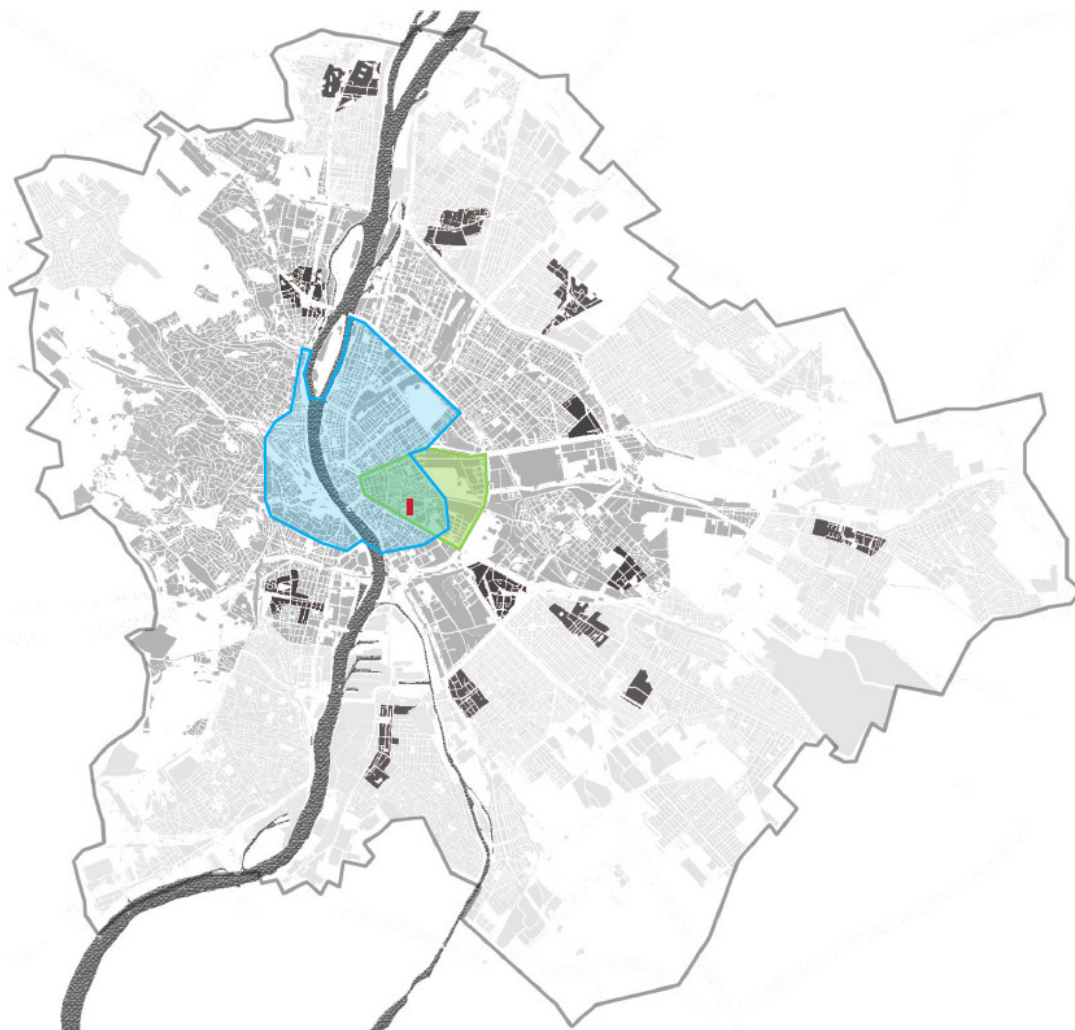
Figure 1. Map of Greater Budapest indicating different developments in the historical periods. Legend: Budapest between 1873 and 1950 (dark grey); suburban zone until 1950 (light grey); historic inner zone (blue); large housing estates with more than 6,000 dwelling units (black); Józsefváros, Budapest’s 8th district (green); Szigony Street, the case study area (red).

The case study area is located in one of the poorest and most stigmatized parts of the historic inner city. Demolition and replacement were and still are used to provoke large scale urban changes in the neighborhood. During the socialist period, the only housing estate in the historic core of the city was built here, and the only megaproject, the Corvin Promenade (originally called