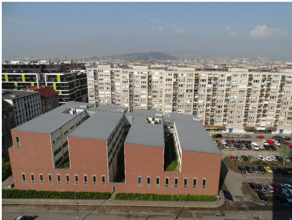
Figure 7. Szigony Street view from a panel building: The contemporary brick university building occupies a part of the planned urban highway between modern slab buildings without any communication with its surroundings.