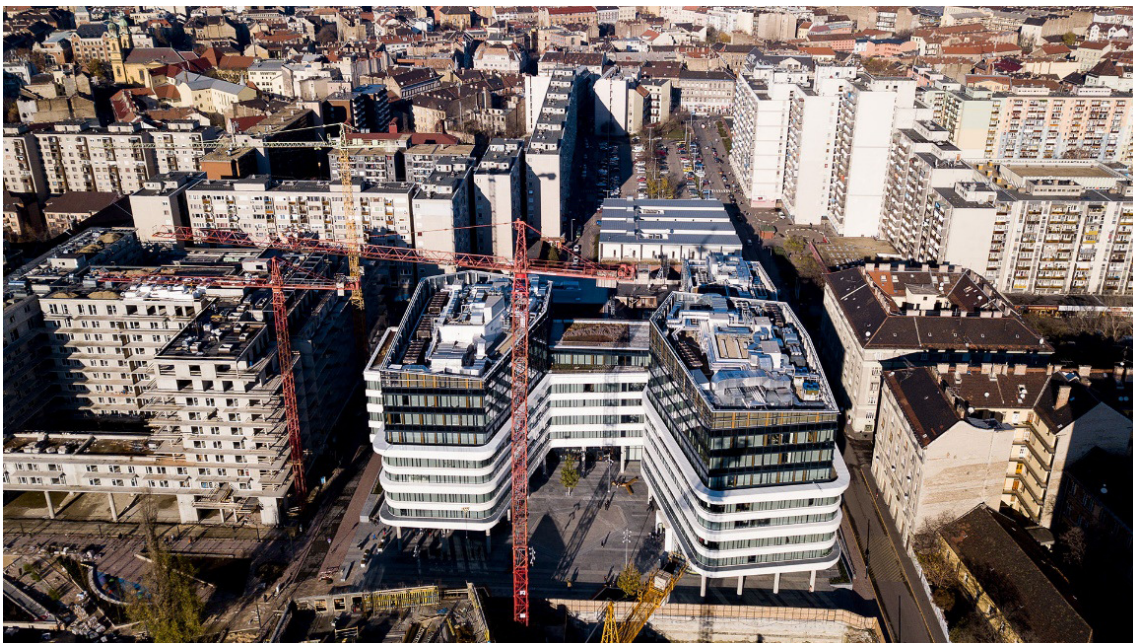
Figure 9. A public webcam took photos during the construction of a large-scale office building at the end of the Corvin Promenade and Szigony Street.

The case study area of Szigony Street in Budapest reflects these three planning phases perfectly. Some island-like historic tenement buildings co-exist with the inherited prefabricated modern housing estate and contemporary new large-scale developments. Diversity characterizes everything: urban form, functions, and users.