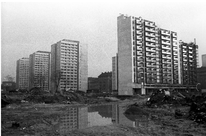
Figure 8. Modern mass housing estate on Szigony Street.

The historic research was accompanied by several open-access databases. In Hungary, Fortepan (2010), a Hungarian-developed community-based copyright-free platform gives the opportunity to share archive photos of citizens and institutions. In 2021, almost 150,000 images are available, and several hundreds were taken in the Szigony Street area (see Figure 8).