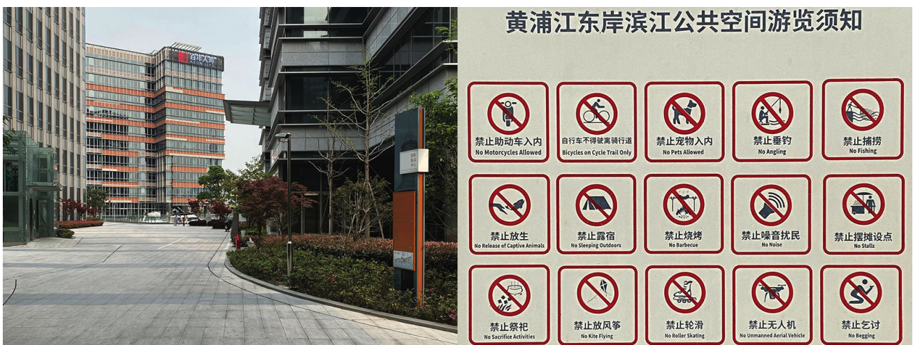
Figure 6. Multiple vacant offices, here at North Bund, and limitations in the use of public space, here on former Expo 2010 site.

Urban planning and design in China is characterized by impressively large investments in advance for public infrastructures (including public space and cultural facilities). This helps to create an attractive environment for investors and citizens, which are expected to come eventually, even after years of vacancy (Shepard, 2015). In the People’s Republic, all urban land is owned by the state. Selling land-use rights is a main source of income for local