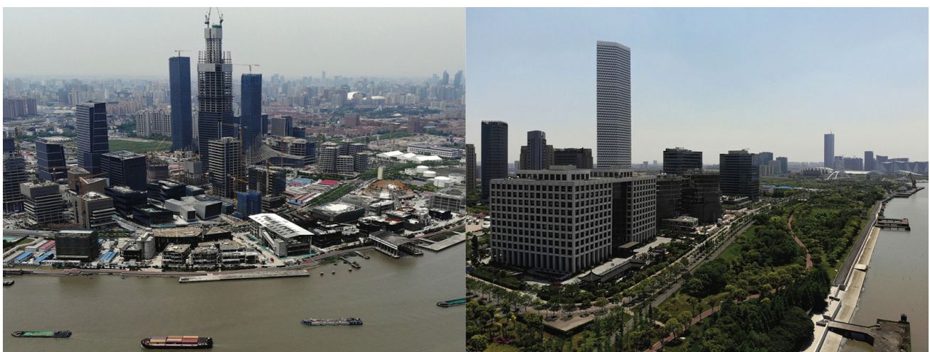
Figure 5. Emerging urban megaprojects AI Town (left picture) and Houtan (right picture), with super-tall landmarks.