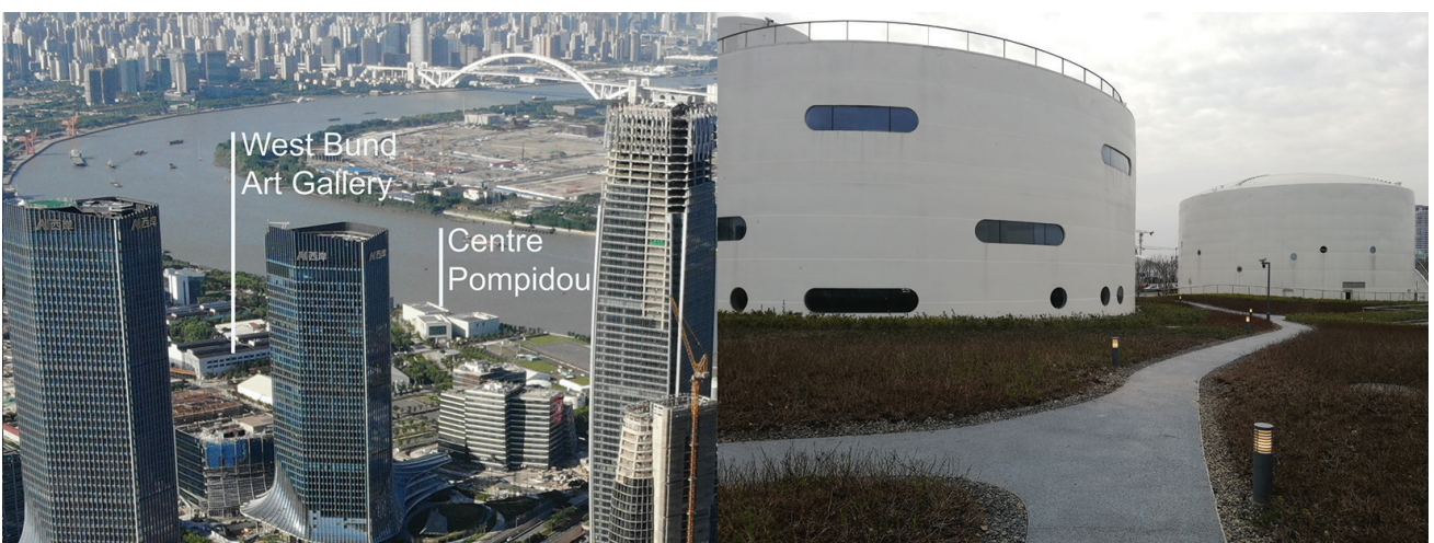
Figure 3. On the left, the AI Town under construction. Between the towers, several art institutes are still visible. On the right, the TANK Shanghai, a pioneering and multifunctional art centre in former oil storage.

Administration, 2018a). West Bund is (after the classic Bund) the most intensively used of the new waterfronts in Shanghai. It enjoys experimental exceptions in its freedom of use: Unlike in most other sections visitors are allowed to bring pets and play with kites. Picnic blankets and tents can be spotted on the lawns. There is a large area for electronic dance music events and a skate park. This all has put West Bund on the mental map of a culture-oriented, educated, young, and middle-class section of the population and of international expatriates. In terms of square meters, West Bund is one of the largest art districts in Asia. Its success can be attributed to the proximity of high-end neighbourhoods, tax incentives, and rent-free leases for cultural institutes (Zhou, 2017). In 2013 several buildings were offered for short-term lease to local architecture offices for their emerging practices, and to add a sense of creative entrepreneurial flavour. As soon as the pilot AI Town is completed (Figure 3), these studios could be dismantled. After an innovative journey of branding by creating