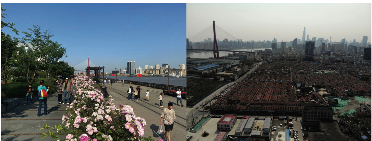
Figure 4. Behind the scenic Yangpu waterfront, working-class neighbourhoods are being demolished.

In the international discourse urban labs are supposed to supplement or even replace traditional urban planning approaches, especially following the global economic crash of 2008. Local authorities frequently use urban labs to mask a lack of funding, or to suggest public-private partnerships (Karvonen, 2016). The Covid-19 pandemic accelerated the use of urban labs (Honey-Rosés, 2021; Rowe, 2021). In contrast to the grassroots elements in urban labs, the demonstration zones and pilot projects along the Huangpu River are initiated in a top-down manner and are controlled by the local government, usually with substantial international help: investors, engineers, designers and other professionals. Some of these projects experiment with public