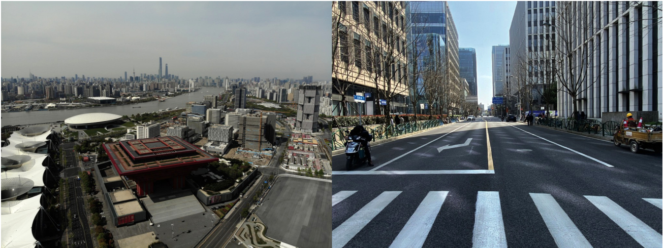
Figure 2. Two pictures of the former expo area filled with grade-A offices around remaining expo-pavilions. Source: Author (Summer 2020).

also a Cultural and Financial Cooperation Pilot Zone that experimented with new forms of “government-led regeneration with market-oriented management and collaborative governance” (Qiu, 2019). Its innovation journey started with the experimental West Bund biennial in 2013 in a former airplane factory. Since 2015 this biennial is renamed in Shanghai Urban Space Art Season, co-organized by West Bund and the municipal Urban Planning Bureau. With a range of onsite events and installations along the waterfront, the aim has been to attract people and (international) investors. West Bund has become a brand. In line with Museum Mile in New York and South Bank in London, a range of museums, galleries, and art events were invited to West Bund. In 2019 even Centre Pompidou opened a branch in the presence of Emmanuel Macron, president of the French Republic. The planning is said to be in accord with ecological civilization by using “culture-oriented, eco-based and technological-innovation-driven” development principles (Shanghai Planning and Land Resource