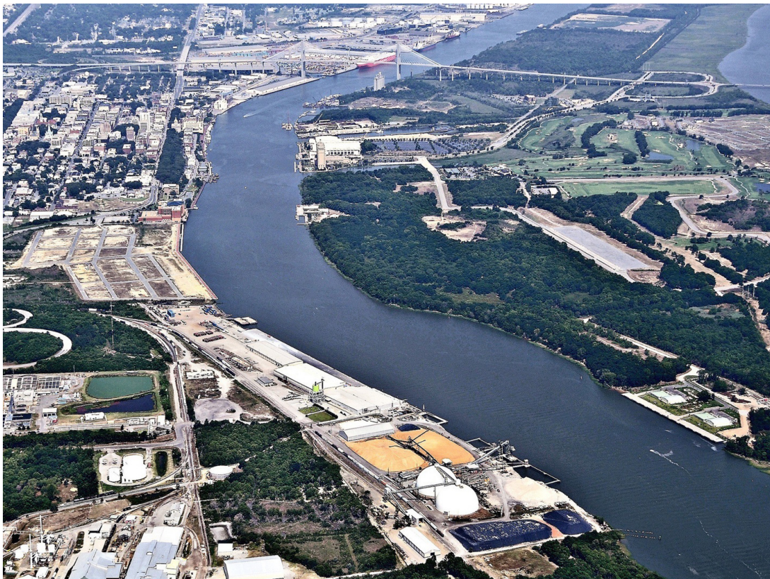
Figure 3. Peebles Industries—Wood Pellet bulk storage at the East Coast Terminal on the Savannah River.