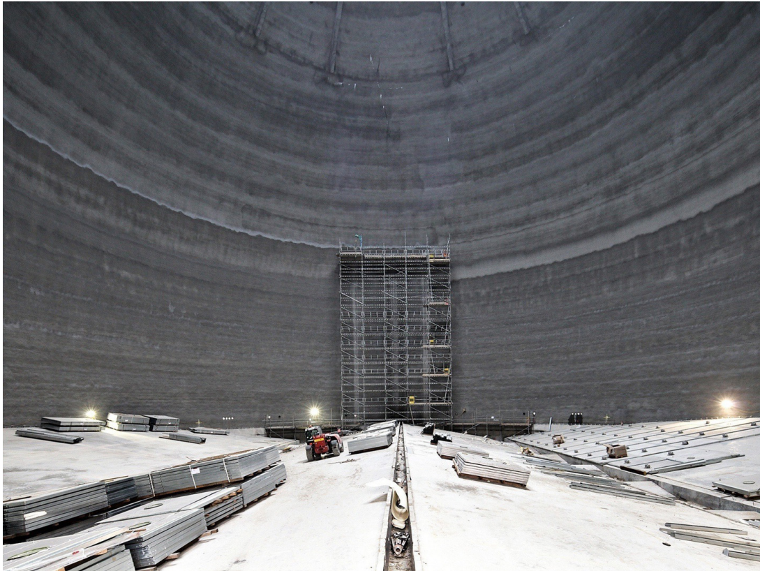
Figure 2. Dome silos under construction at the 20 Power Station in Selby, North Yorkshire, England.