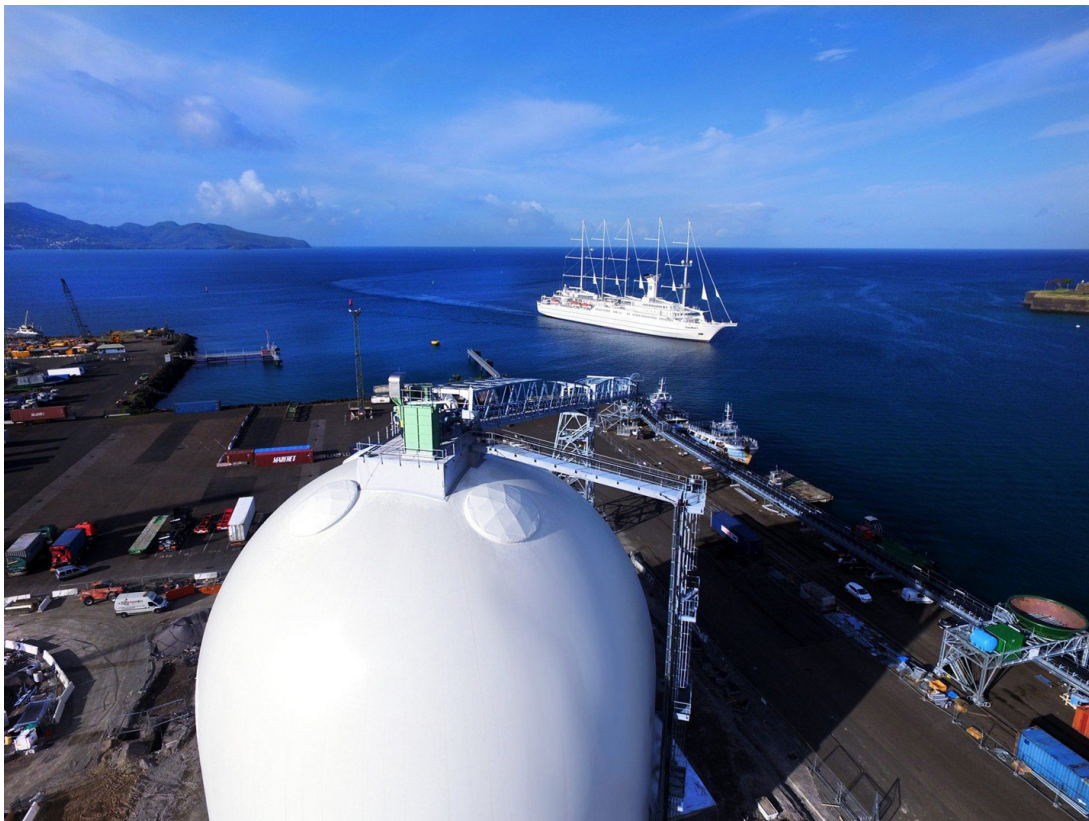
Figure 5. Albioma Wood Pellet Dome in Martinique.