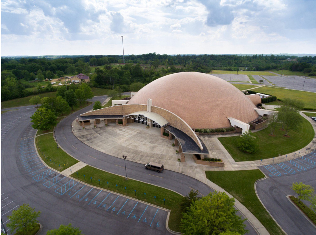
Figure 7. 73-ft high dome at Faith Chapel in Birmingham, Alabama, completed in December 2002.