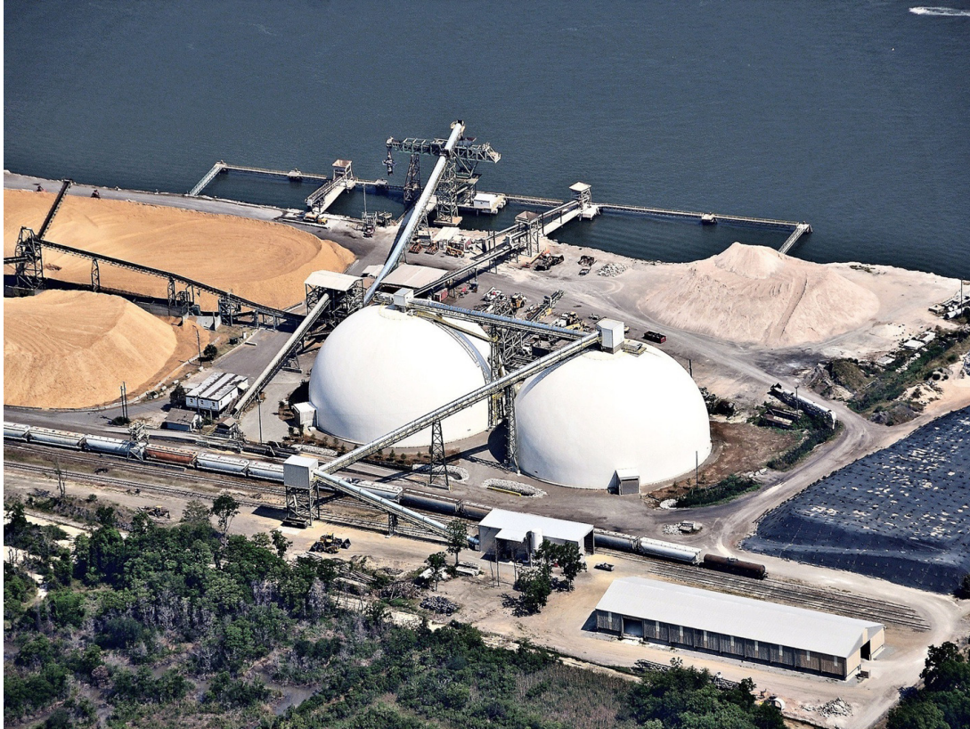
Figure 4. Peeples Industries—Wood Pellet bulk storage silos.