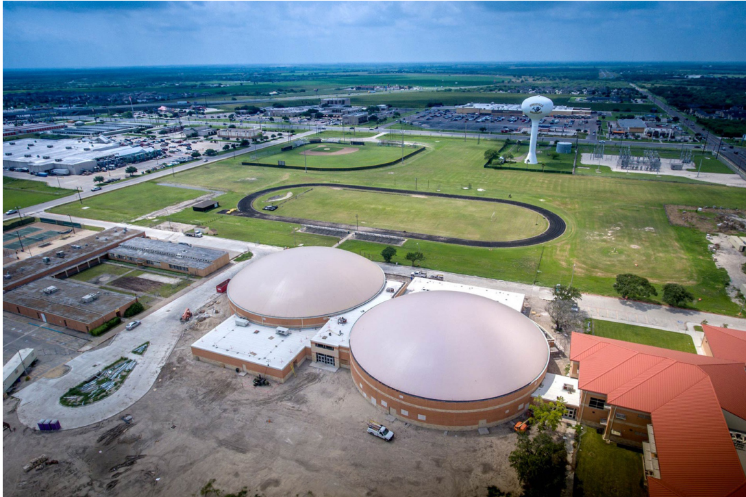
Figure 6. Kingsville Independent School District Community storm shelter in Kingsville, Texas, on the Gulf Coast.