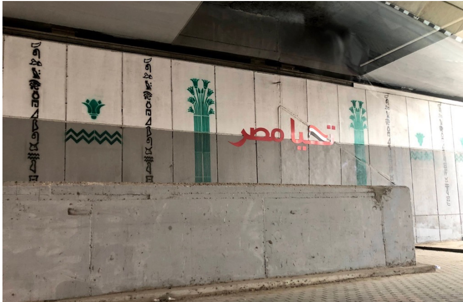
Figure 5. Tahya Masr (“Long Live Egypt”), a national slogan under a newly constructed bridge.

When we drove through the eastern neighbourhoods of Cairo, we noticed that the widening of roads and the construction of several flyovers in the neighbourhood taking place rapidly and without any prior announcements. Later, the survey respondents and interviews confirmed these observations. The reason was that in August 2018, several national transport-related projects were put in place and implemented rapidly (Al-Youm, 2018). Almost all of these projects were introduced suddenly, without any prior public information or