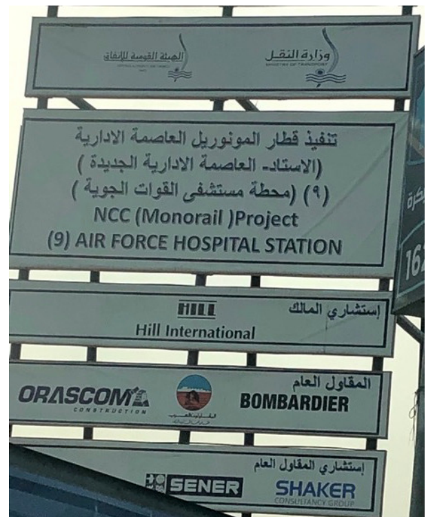
Figure 10. Monorail construction in New Cairo district. Note: Date: January 2021.