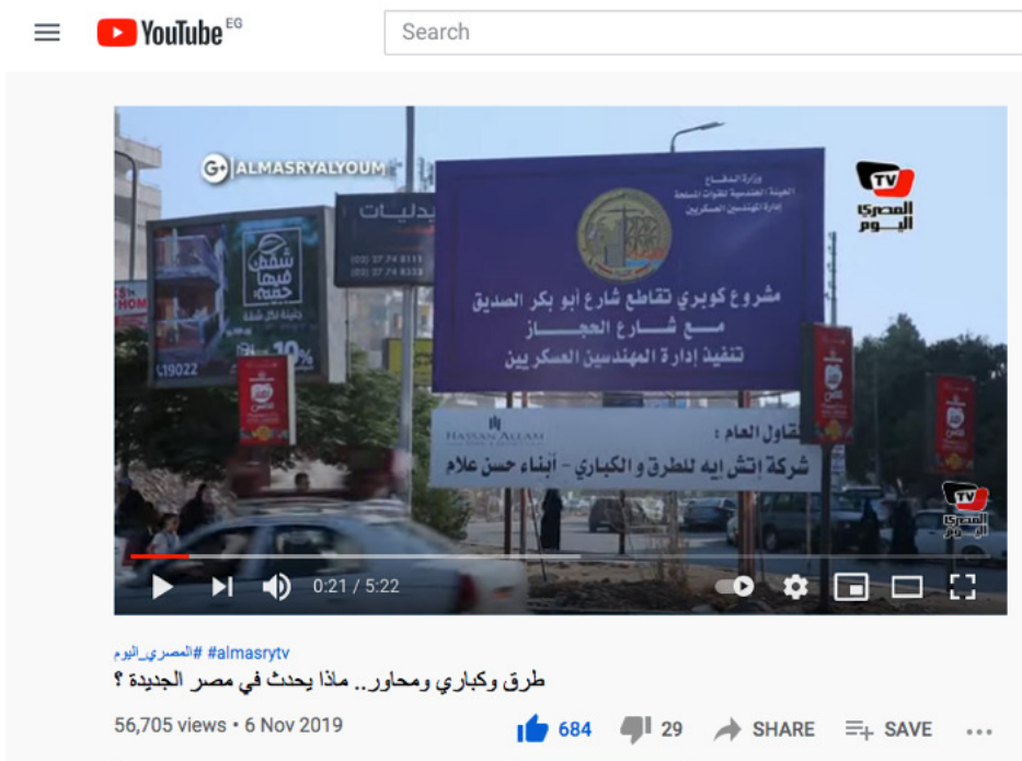
Figure 6. “Roads, axes and bridges...what is happening in Masr Al Gedida? Al-Masry Al-Youm newspaper covering the new roads, interchanges and bridges’ construction in Heliopolis.”

As these projects ran, during the construction works, the neighbourhood had already begun to experience the enclaving. For example, in the sub-district of Almaza, the residents had had no easy entry to or exit from their neighbourhood during the construction of a bridge