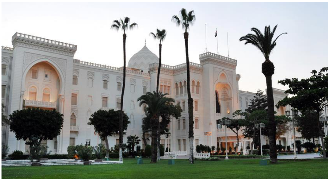
Figure 3. The Ittihadeya Palace (Grand Heliopolis Hotel).

of socio-spatial fragmentation of the middle class(es) in that context. The rapid planning and execution of these new urban interventions have been a cause for suspicion and worry to planners and observers. Therefore, we embarked on this article in an attempt to explain and