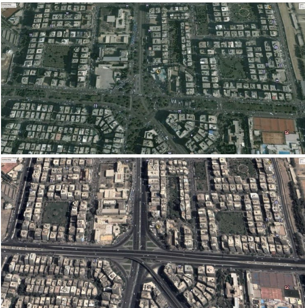
ميدان الهجاز قبل وبعد التطوير..

Yet, paving the way to the New Capital is not the only explanation for such urban aggression. We also