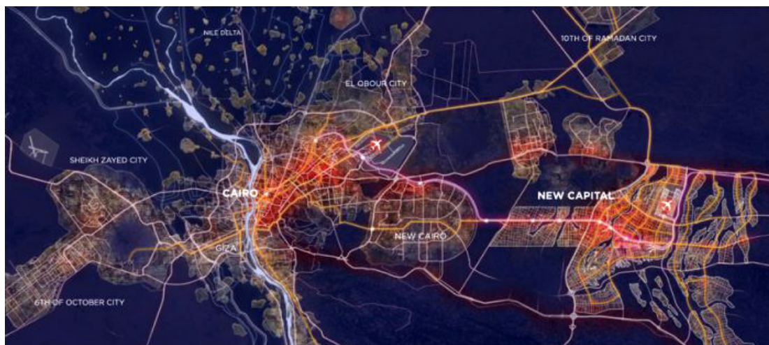
Figure 1. The NAC location.

In that regard, the importance of Heliopolis arises from its heavy share of the political and urban history of the city (Zaineldine, 2020), including its colonial and post-colonial roots. This article describes and analyses