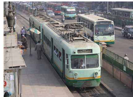
Egyptian state removes tram line in Heliopolis amid public outrage, and despite previous public appeals for its overhaul