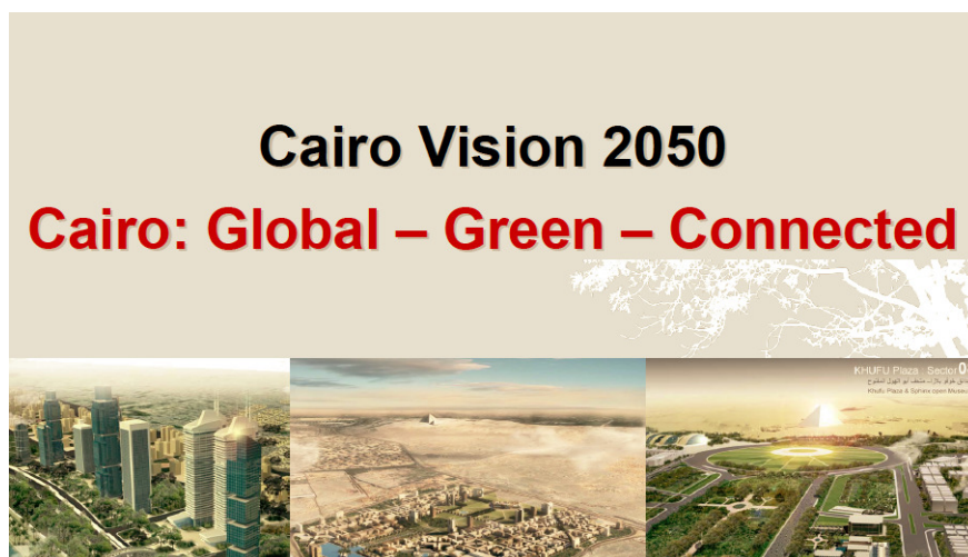
Figure 4. Cairo as a Global City. Source: General Organisation of Physical Planning and Ministry of Housing (2010).

This comes, of course, at the expense of the citizenry, as became evident in several forced evictions in several cases in downtown Cairo, intending to recapture land value by instrumentalising the rhetoric of informality as well as by dislocating the poor from the central parts of the city (Adham, 2014). Therefore, the