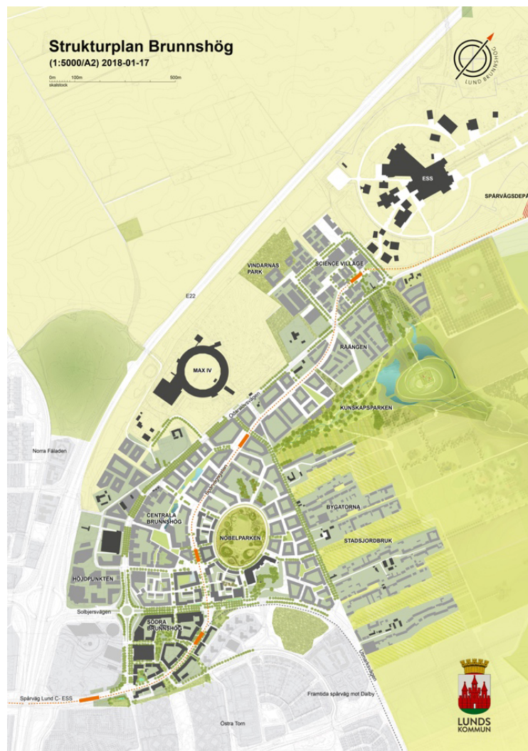
Figure 1. Map of Brunnsbö development area.

The plot of land of Råängen is financially and institutionally linked to the cathedral building in the city center. The Cathedral of Lund dates back to at least the