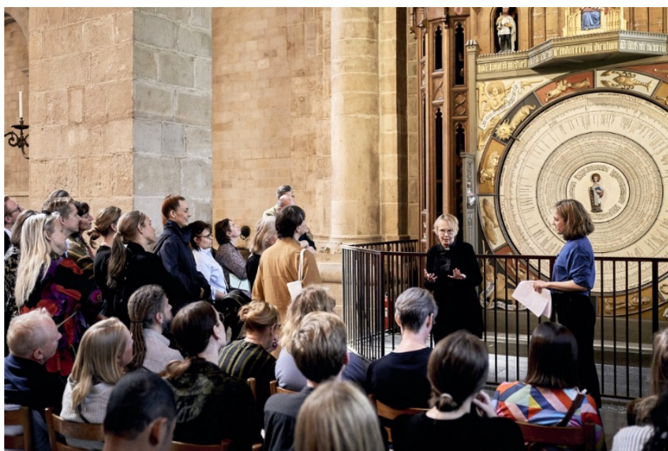
Figure 4. Time seminar in Lund Cathedral, 18 April 2018.

It was aesthetically disturbing (it didn’t look like art!) and asked uncomfortable questions about Sweden’s