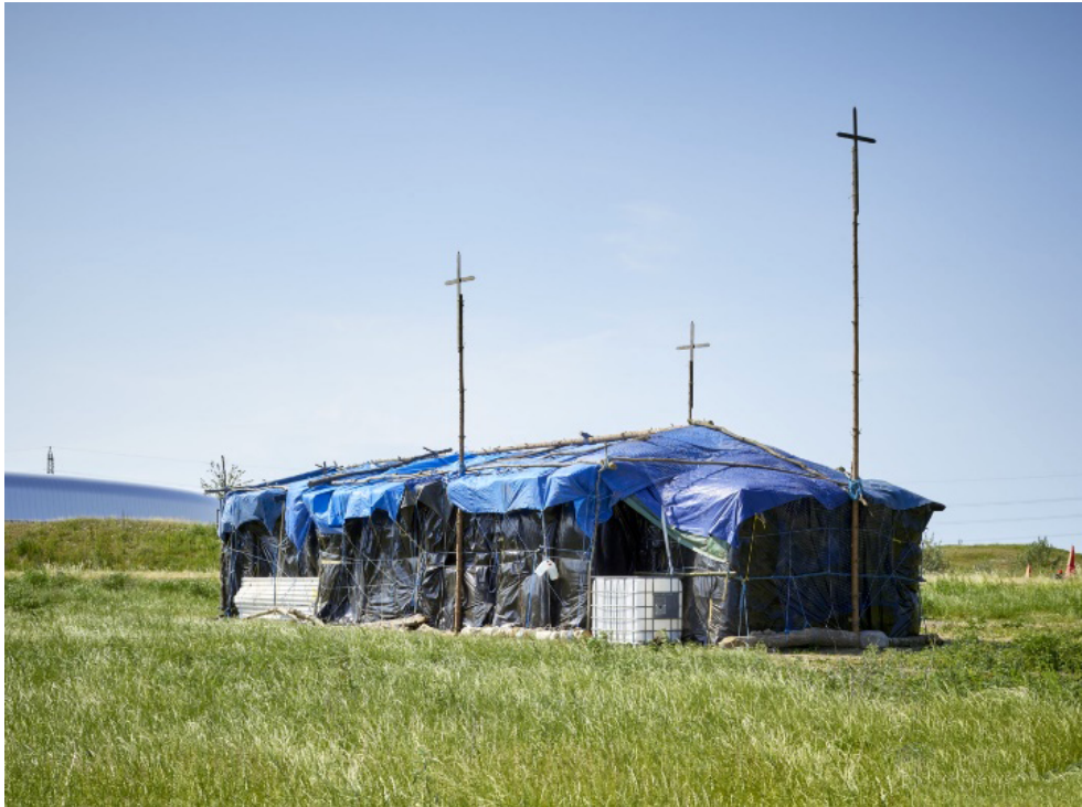
Figure 5. And We Are Everywhere , by Nathan Coley, Lund 2018–2019.

relationship to immigration, people with no home, the church’s place in the land. We were intrigued by the silence with which it was greeted, but of course, this was all part and parcel of people ‘expressing’ their discomfort.