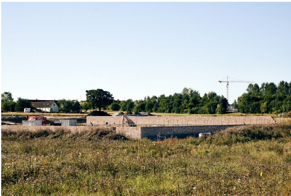
Figure 6. Construction of Hage developed by Brendeland & Kristoffersen.

Furthermore, as the planning process progresses, the Råängen project’s multi-layered and complex relationship with the municipality will intensify. While the collaboration has been constructive—as, for example, when the municipal planning council approved a building permit for Hage despite missing the required detailed zoning plan—it also has become clear that Råängen does not fit the development logic of Brunnsög, with its clearly defined objectives and the necessity to build infrastructure quickly. While one of the city planners referred to