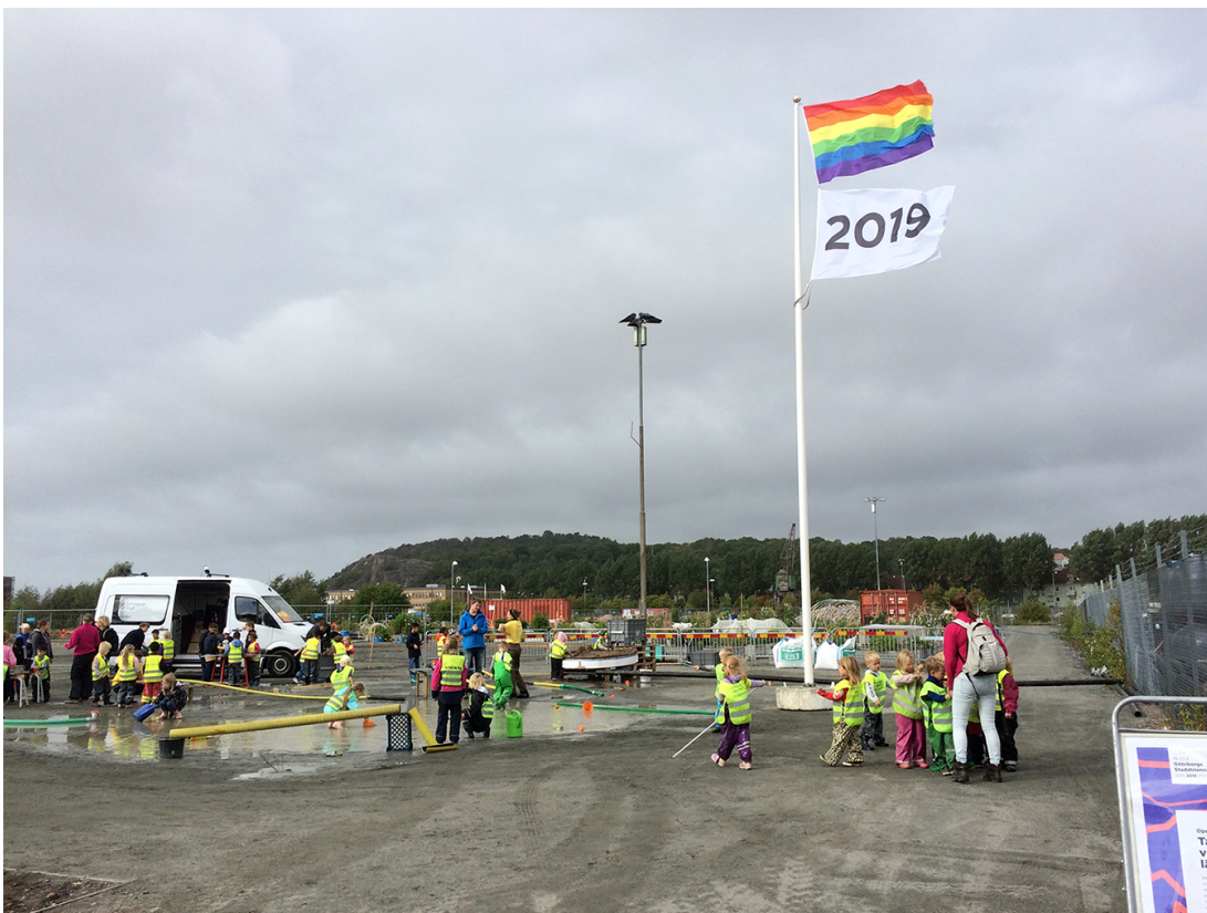
Figure 2. Open call with children: Investigating what a future playground could be in scale 1:1 (2018).