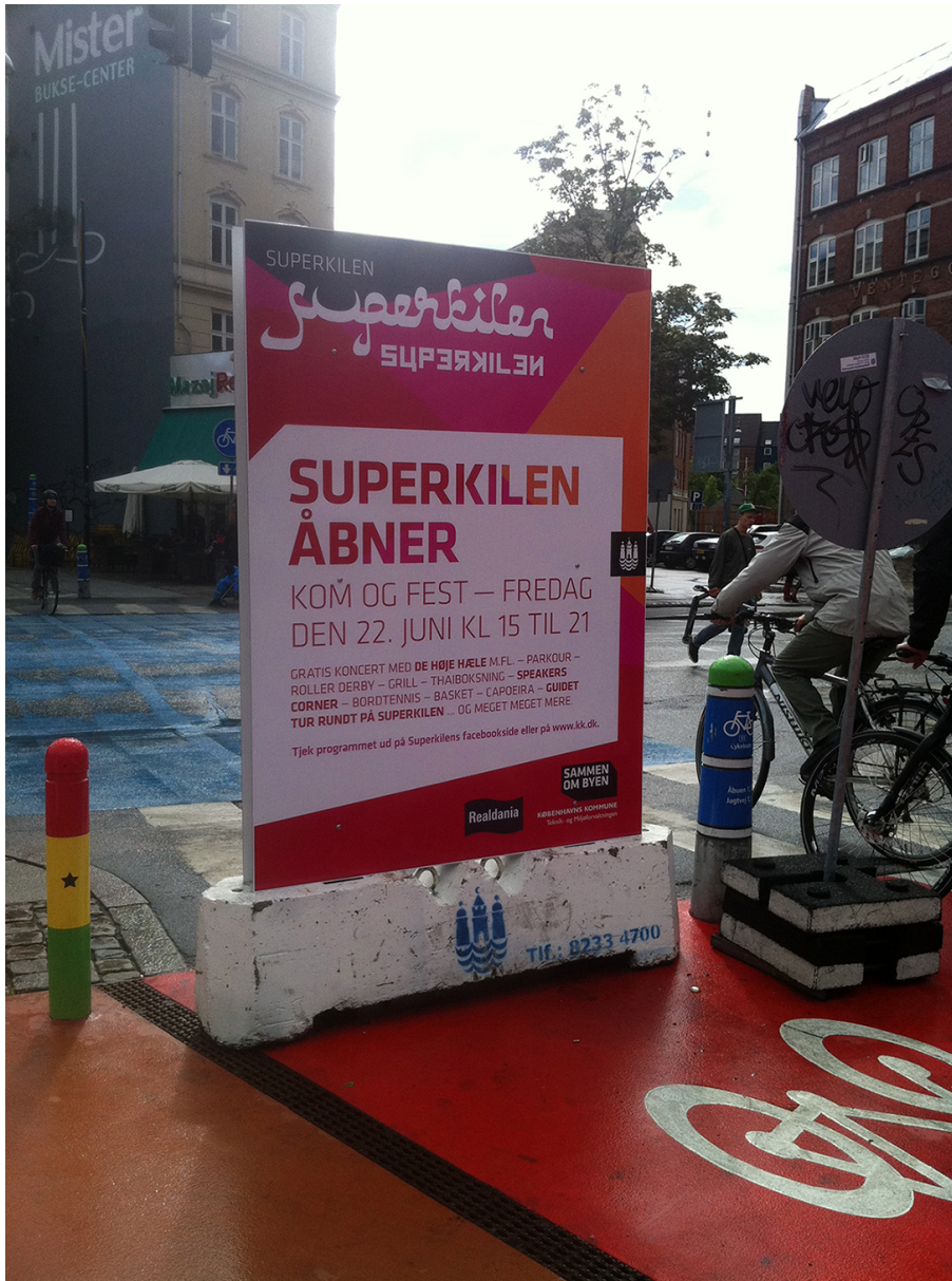
Figure 4. ‘Superkilen is opening: Come and party’: Billboard announcing the opening of Superkilen, June 2012.

highlighting the universal and designing for transversal connections.