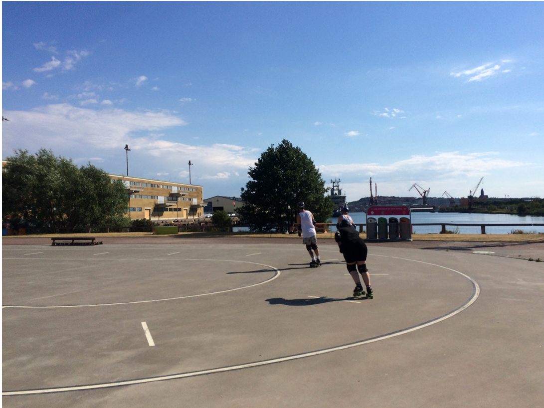
Figure 3. Roller derby training at Jubileumsparken (2018).