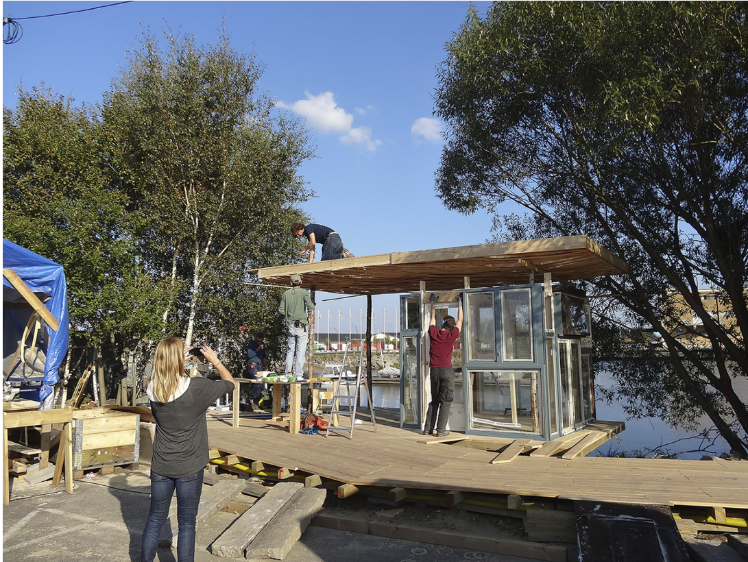
Figure 1. Building a small library pavilion during a public workshop at Jubileumsparken (2014).