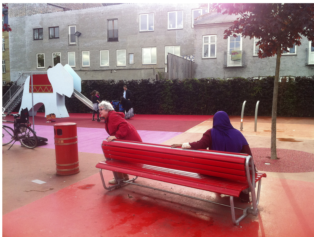
Figure 6. Objects at Superkilen: A British litterbin, a bench from Zurich and an elephant slide from Pripyat, the abandoned town for workers at Chernobyl (2015).