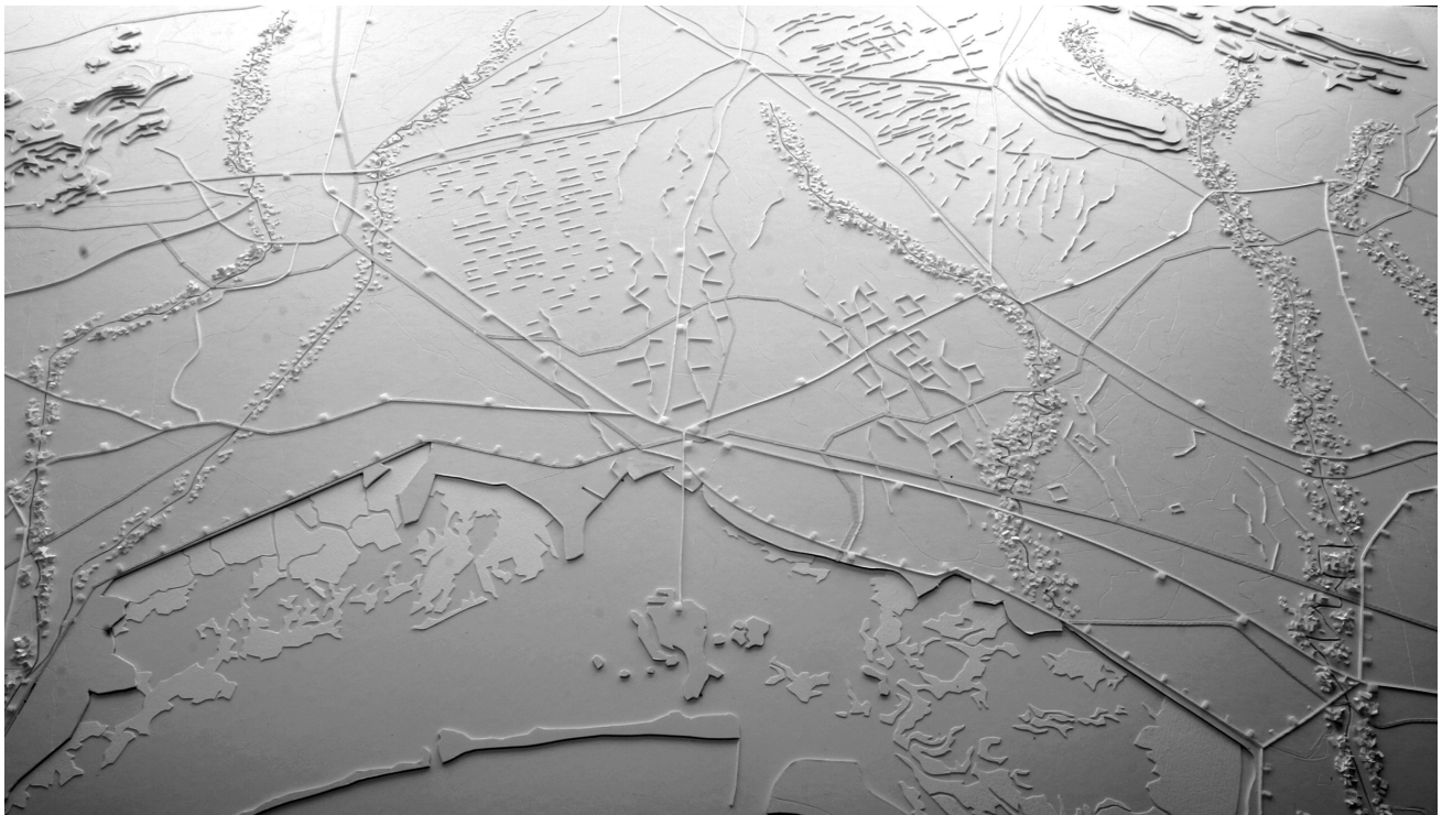
Figure 1. Isotropy as a figure of political rationality. Source: Viganò, Secchi, and Fabian (2016). Image credits due to B. Secchi, P. Viganò and IUAV PhD students at “Water and Asphalt,” Venice Architecture Biennale, 2006.

The two systems of “water and asphalt” and their logics of accessibility and water management emerge as organizational structures of space and society, inescapable elements of any interpretation of the widespread contemporary urban condition and at the basis of each exploration of the future of new urban-rural configurations. It is their slow transformation and, together, the destructive force of some events (for instance the route of a motorway that interrupts the flow of water from the slopes and the network of canals), or the evolution of techniques (from a surface irrigation network to its demise and burial) that become part of