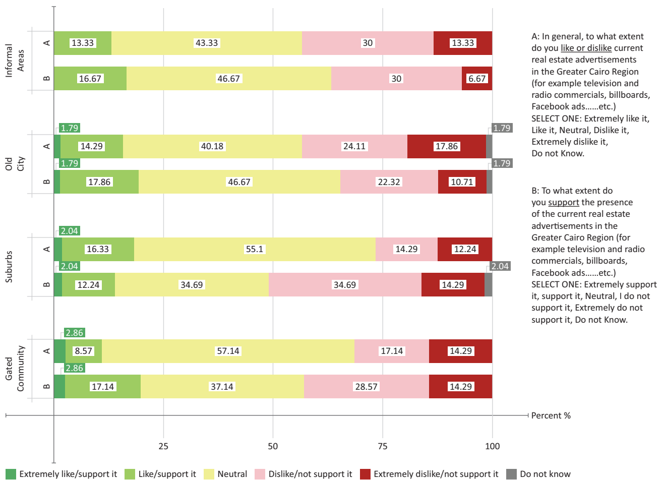
Figure 3. (A) Distribution of the sample by the type of neighborhood and their perceptions/satisfaction about the current real estate advertisements. Source: Author’s calculations (Pearson \chi^2(20) = 11.4971 Pr = 0.932). (B) Distribution of the sample by the type of neighborhood and their support of the presence of the current real estate advertisements. Source: Author’s calculations (Pearson \chi^2(20) = 11.4273 Pr = 0.934).

The personal story is integrated into the study in order to interpret the data from a socio-cultural perspective. The use of autoethnography (Adams et al., 2014) stimulates