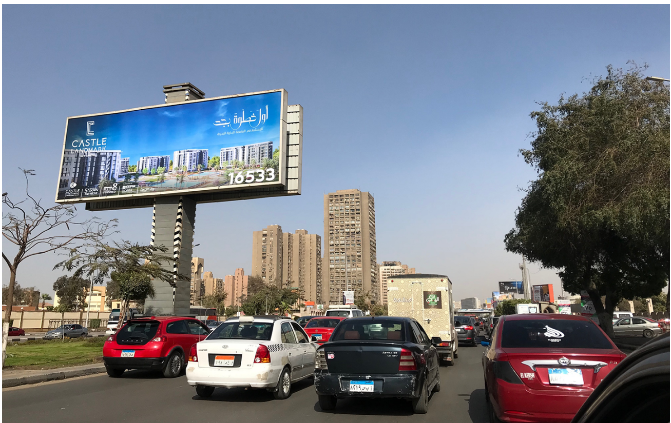
Figure 1. Two billboards on Salah Salem road in Cairo.

Accordingly, we want to shift the attention towards the public and its demand for housing. Our article demonstrates the urban everyday experiences of a population in a country in which a visual culture established via public media creates an urban imaginary that does not match the lived social, spatial, or economic reality of the majority of the population (Hendawy, in press-b; Hendawy & Saeed, 2019). Exploration of the general public’s attitudes towards media narratives that focus their advertisement on high class residential projects launched this investigation. We base our arguments on empirical studies in the Greater Cairo Region (GCR). The Greater Cairo Region consists of Cairo Governorate, Giza Governorate, and parts of Qalyubia Governorate, with a total population of around 18 million as of 2006 (Bush & Ayebe, 2012). In this setting, a puzzle from our collected data guides our central research question: Why aren’t ads for luxury housing—a market segment that