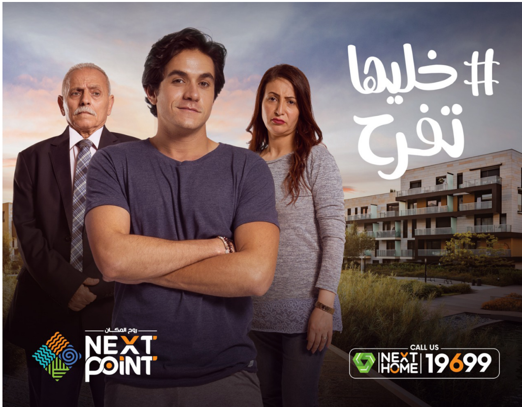
Figure 2. Photo from Cairo’s real estate street billboards (translation: Make her happy).

caters beyond the reach of most Egyptians—condemned by those who cannot afford it? The pervasiveness of real-estate advertisement could be interpreted from (1) the government’s perspective and its desire to promote its political agenda manifested through its urban planning schemes, but also from (2) a bottom-up cultural perspective, which functions as an indicator of the general public’s demands or least desires. The former reflection was shared amongst a number of scholars (Daher, 2013; Denis, 2006; Elmouelhi, 2019; Hassan, 2017; Shawkat & Hendawy, 2016), while the latter postulate remains under-explored. Accordingly, our research addresses the following question: