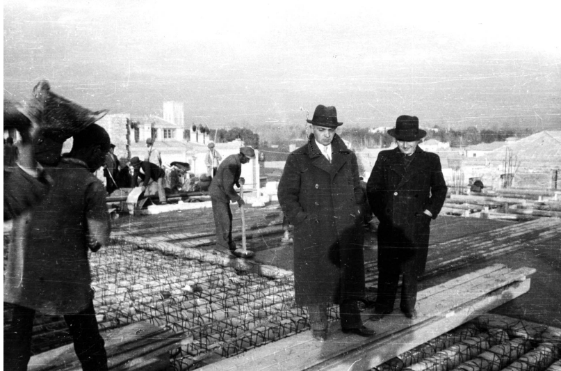
Figure 5. Gabriel Guevrekian on the roof of the Officers' Club, 1937.

European projects, Guevrekian designed every last detail of the crisp five-story building, right down to the bricks, which were custom-made to achieve the correct proportions of walls and openings. Lavishly appointed, the club was decked out with the most advanced building services: the elevators, central heating system, and sanitary fittings were all imported. To balance construction costs, Guevrekian combined these imports with local skills and materials, developing many innovative construction techniques in the process.