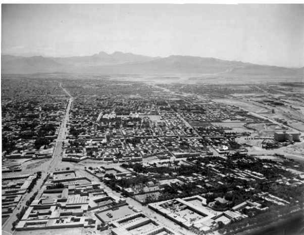
Figure 1. Aerial view of Tehran, eastern border of the city, 1942.

ever, it was not until a decade later that the municipality's administrative structure, its institutional autonomy, and the extent of its spatial practice were fully outlined. Indeed, parallel to that, an idea of city was developed. Between 1927 and 1933, the octagonal boundary and gates were destroyed (Figure 1). All the moats were filled in an effort to reconceptualize the image of the city. Tehran no longer required symbolic representations of religion and power (the reason for the walled city), because it was now completely dependent on its own power of productivity—the mobility of the new capital—which was enhanced through the new regulations and infrastructural interventions linking the city centre to its developing industrial periphery. This state-initiated project was also conducted through various construction regulations that were forcefully applied to buildings. The focal point of the new project was housing, aiming to neutralize the old neighbourhoods' socio-political structure by imposing a new urban form, comprised out of open-ended grid of streets and infrastructure, and new plotted lands, stretched north-south adjacent to the streets. As a result, the architectural typologies of the city were radically changed in a shift that directly impacted the city's social structure. 2