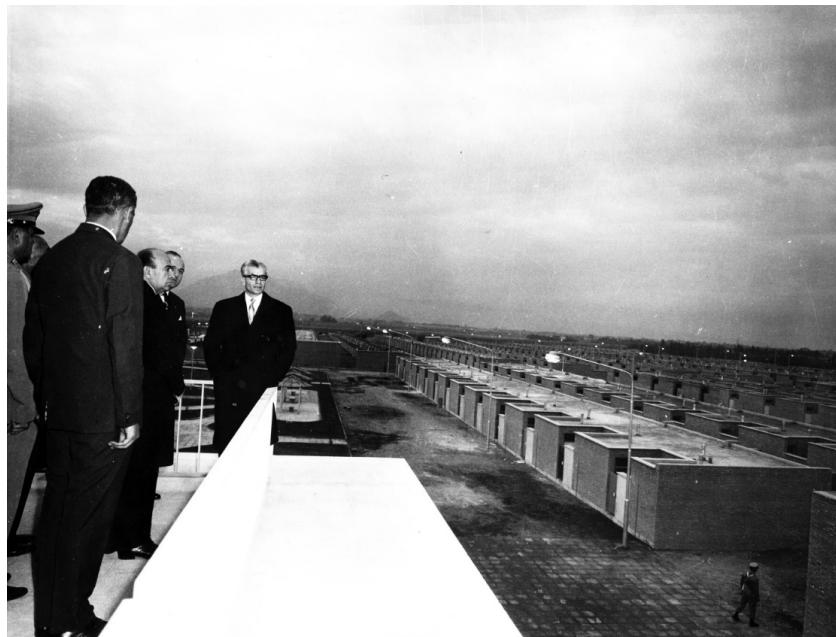
Figure 9. Kuy-e Nohom-e Aban, mass housing project in Tehran, 1962.

was the absolute priority. The design of the housing typologies thus strictly followed the ideas for the socialization of the household tasks promoted by Silvio Macetti (Kianouri):