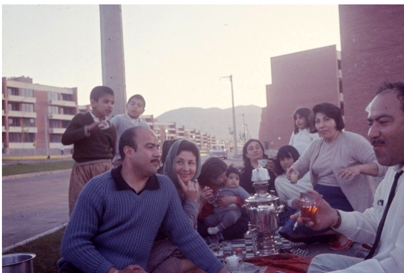
Figure 11. Kuy-e Kan's residents using the side-walks as a collective space for gathering and eating, 1964.