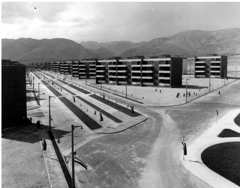
Figure 10. Kuy-e Kan, mass housing project in Tehran, 1964.

Tehran's typical apartment was in fact born out of such ideological recuperation of the modernist princi-