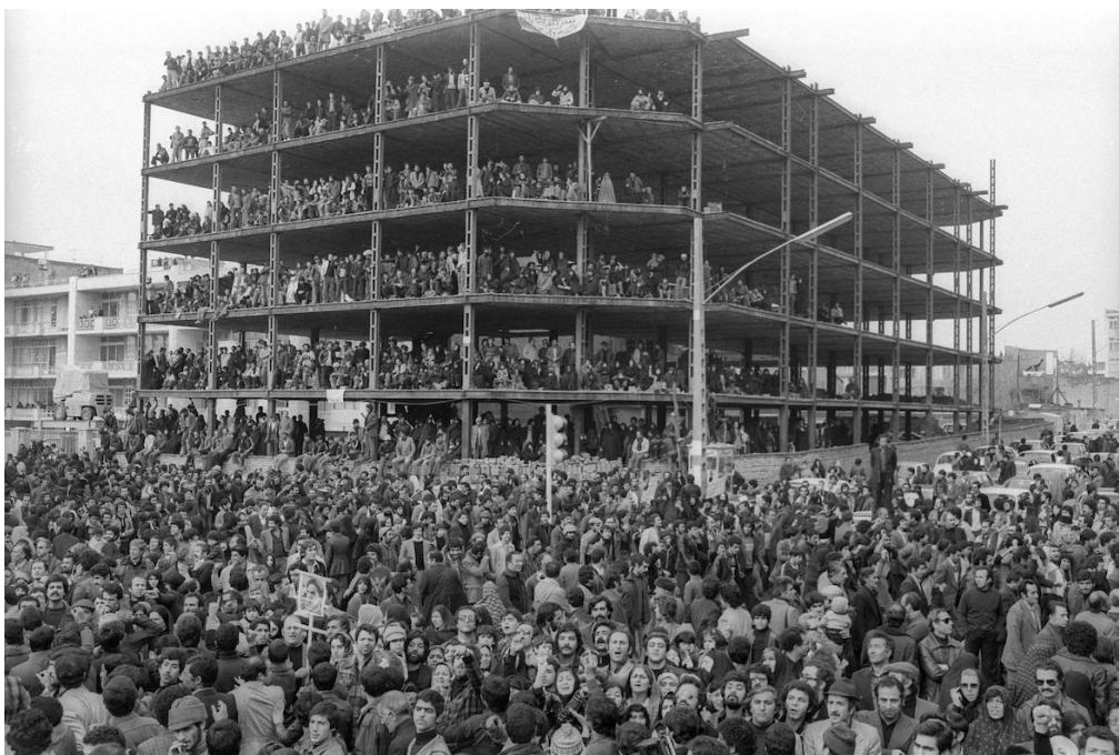
Figure 12. Islamic Revolution, February 1979.

ples of urban development. Bare frames that expanded Corbu's dom-ino into a five-story apartment, raised on Guevrekian's common pilotis, equipped with Schütte-Lihotzky's Frankfurt kitchens, and laid out following to Gropius's Zeilenbau's grid; an infrastructure that could accommodate any form of life. Such characteristics—namely domestic space as an infrastructural frame—blurred the strict division between public and private space, between the space of living and space of political action. Consequently, the practice of citizenship is not anymore limited to the city but also flourished within the interiors of the domestic spaces. When public space is policed and controlled, domestic interiors become not only art galleries, clubs, spaces for rituals, cultural centres, workshops, and offices, but spaces for political action. Interiors cease to be the exclusive domain for individual life and family matters; houses become the spaces in which new forms of collective life are experimented and nurtured, and the battleground for social conflicts and political constituencies. Such a specific collective dimension proper to Tehran—more than private, but not yet public. At the same time some of the domestic activities extend their domains to the public realm, where the life itself becomes a political project (Figure 12).