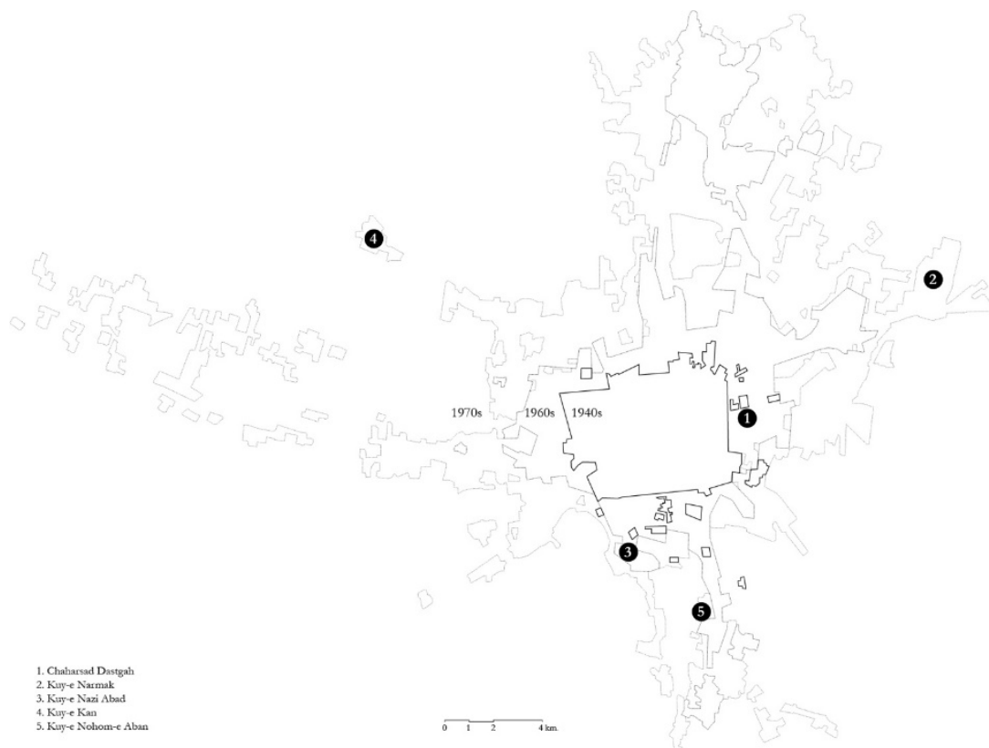
Figure 7. Tehran’s Urban Growth (1940s to the 1970s) and the locations of the early social housing projects.

The initial idea of these projects was to build high-density quarters with tall slabs, quite similar to the typologies that Macetti had proposed. However, owing to a lack of financial support and sufficient executive power to be able to afford and introduce such technologies for large-scale blocks, the Association of Iranian Architects decided to develop the projects with low-tech construction and low-cost building materials and techniques. The plan of the dwelling units was reduced to a bare minimum of spaces, series of bedrooms with almost no living room or spacious kitchen, as used to be the case in traditional Iranian houses (Figure 9). The projects were provided with day-care centres, public laundry facilities, and, of course, community spaces most of which were later converted to Tudeh Party clubs. For them the social, political, and economic performance of the projects