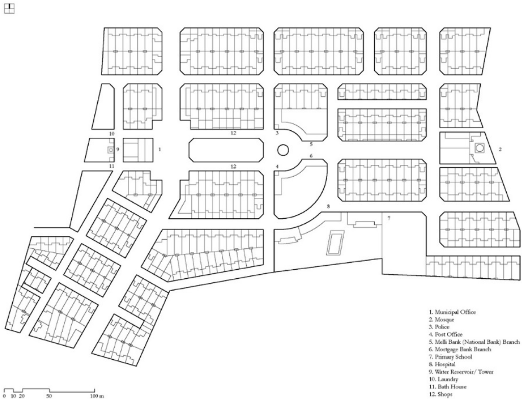
Figure 8. Plan of Chaharsad Dastgah housing project.