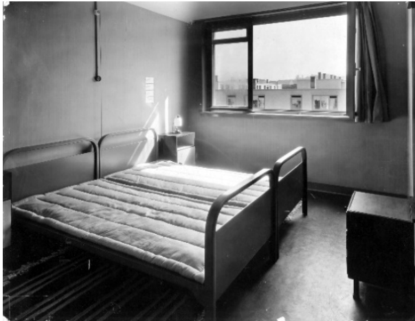
Figure 1. The 'Woba' Residential Colony Eglisee, 1930. Block 8, Artaria & Schmidt Architects. Bedroom, upper floor.

Although the street's name evokes images of exotic lands in distant countries, and could give grounds for speculations about exoticizing the flat-roof settlement, the street was formerly called Gotterbarmweg and only re-named in 1941 (Schnetzler, 2005).