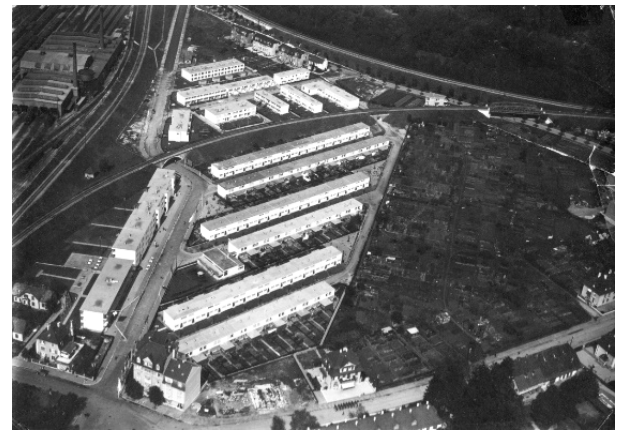
Figure 3. Siedlung Schorenmaten, 1929, and Woba-Siedlung Eglisee, 1930 ("Siedlung Schorenmaten," 1930).

an important Basel-based architect and city planner. The realization of the Eglisee residential colony marked the endpoint of a larger urban development project of the Hirzbrunnen area on the outskirts of Basel (Mooser, 2000; Pola & Frischknecht, n.d.; Wohnbaugenossenschaften Nordwestschweiz, 2012). During the heyday of the cooperative housing movement in interwar Basel, around 250 houses were built in garden city fashion by Bernoulli and Künzel—all of them with steep roofs. It was only in 1928 when Hans Schmidt and Paul Artaria took over Hans Bernoulli's position as co-planners of the housing cooperative's Lange Erlen and Rüttibrunnen that the flat roof first appeared in Basel's residential areas (Figure 3; Artaria & Schmidt Architekten, 1928; Pläne der Wohngenossenschaften Lange Erlen, 1928).