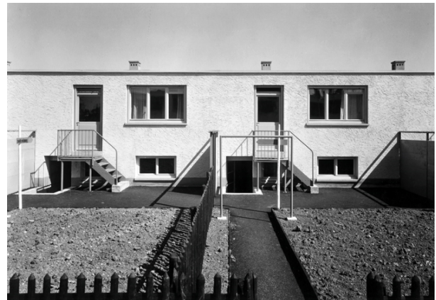
Figure 5. The ‘Woba’ Residential Colony Eglisee, 1930. Block 10, Hans Bernoulli, August Künzel. From the garden.

simplification of the furniture. For [artists and architects], furniture is not a showpiece, but a commodity. The comfort and homeliness of a room does not depend solely on the furniture or even on a single beautiful piece, but on the practical design and arrangement of a room....Today we know the problem of the new home is not merely an artistic one, but just as much a technical, economic and socio-ethical one. (Kienzle, 1926, pp. 3–4, 7–8.)