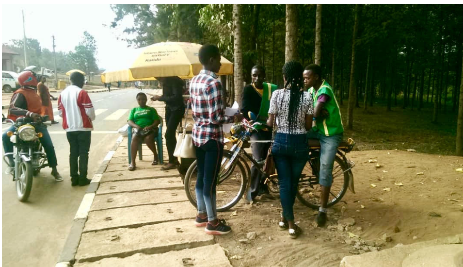
Figure 3. City-wide public space survey being conducted in Nyagatare, in August 2018.

In addition to the survey, a technical assessment of public spaces in Rwanda's six secondary cities was undertaken to gather information on what facilities and util-