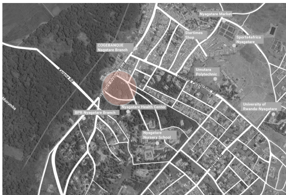
Figure 5. Location of public space within the city of Nyagatare.