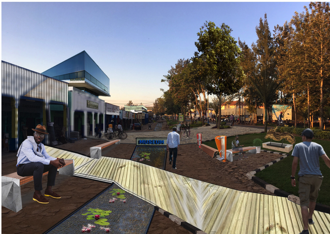
Figure 2. Photoshopped street in Nyagatare where public space elements were added, shared via social media to initiate discussion, in July 2018.

In Rwanda, government and non-government organisations are using online platforms such as Twitter and Whatsapp to share information and receive feedback on public information and decision making. These platforms provide authorities with a virtual space to consult with citizens and on a number of occasions, government initiatives have been revised based on the feedback received online through social media. The use of smartphones is on the rise in Rwanda, and such platforms complement radio, TV shows, and community consultations. With the public space initiative in Nyagatare (Figure 2) and other plans, draft designs were shared via social media and