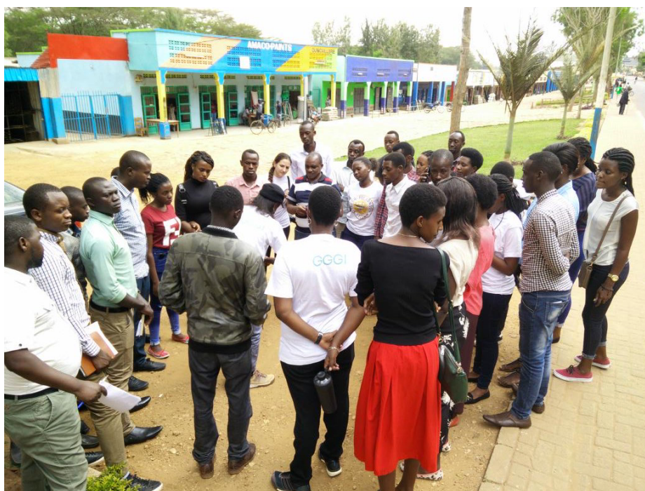
Figure 1. Urban Walk in Nyagatare. The District’s Executive Secretary joined citizens in exploring green areas in the urban core, in October 2018.

The Urban Walks also provided information to citizens on how urban forests contribute in many other ways to quality of city life: as attractive sources of shelter and shade, with aesthetic qualities that increase property values and therefore tax revenues too. With well-considered planning and design, urban forests in Nyagatare could be transformed into public spaces hosting recreational and leisure activities. Access to public open space is important to increase recreational walking: while this is commonly referenced in high-income