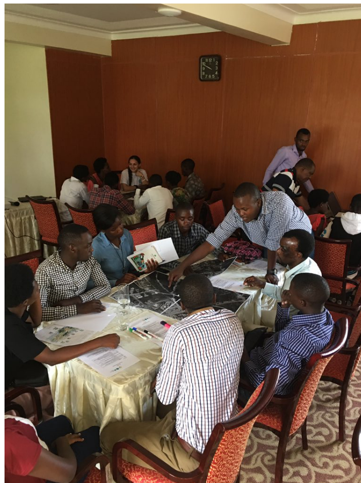
Figure 6. Public space participatory design workshop in Nyagatare, in November 2018.

In Nyagatare, although the DDS refers to resilience in terms of agricultural production, in an urban context, the master plan revision process defines resilience in terms of actions at the household level (such as rainwater harvesting systems), in construction and building (though the promotion of green building codes), water management systems and public spaces that can be used for improving climate resilience. For example, in Nyagatare, public space, coupled with agroforestry and water management, can support water retention for longer periods and its use for community gardens and public space maintenance, important in particular during the pro-