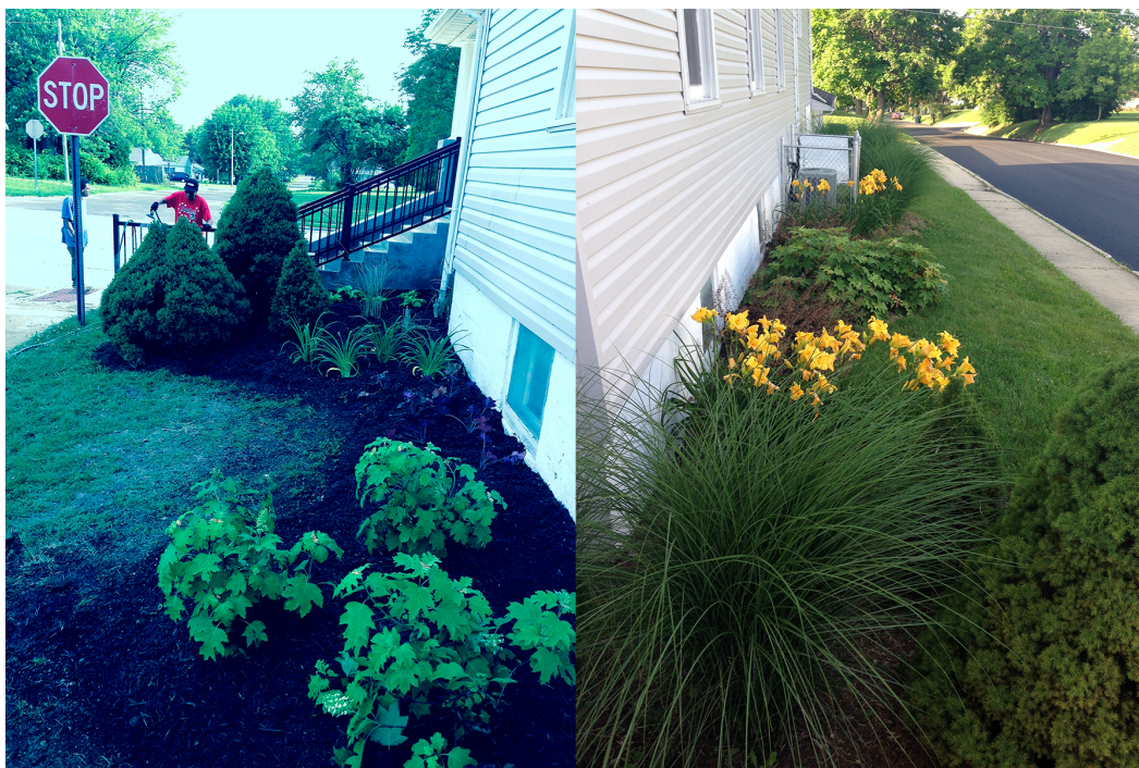
Figure 4. Schaffer Chapel northwest garden at the completion of the installation in June of 2014 (left), and in July of 2015 (right).

While still in its infancy, the Whitely Community Council began restoration on a historically significant civil rights church known as the Schaffer Chapel. While funding had been made available for the restoration of the church roof and siding, little money had been set aside for other aspects of the restoration such as parking or landscaping. To improve the church's image from the street on the northwest corner of the church, the council leadership worked with Ball State University and the Minnetrista Cultural Centre in 2014 to establish a planting plan and the obtain flowers needed for the garden at little cost to the community. A community work day was held and in the space of one day, the garden was installed (see Figure 4).