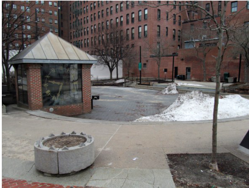
Figure 1. Congress Park, Portland, Maine, before community interventions in the early 2000s (image courtesy of Project for Public Spaces, retrieved from https://www.pps.org/article/the-story-of-congress-square-park-how-a-derelict-plaza-got-a-new-identity-downtown ).

the Friends of Congress Square Park was formed bring the community together and revitalize the park. The group raised money, attention, and a great deal of interest in the park through the use of signs like “I want...in Congress Square” that were left around the city, and that the general public could write on all to share their aspirations for the park’s future. The community group then started cleaning up the park and adding amenities (see Figure 2).