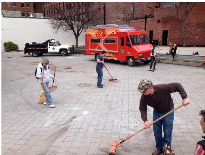
Figure 2. Friends of Congress Park during the park clean-up and revitalization of the park (image courtesy of Project for Public Spaces, retrieved from https://www.pps.org/article/the-story-of-congress-square-park-how-a-derelict-plaza-got-a-new-identity-downtown ).