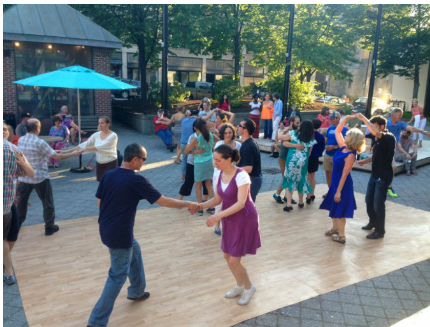
Figure 3. Swing dancing in Congress Park Square, Portland, Maine.

With community-based participation at its centre, an effective Placemaking process capitalizes on a local