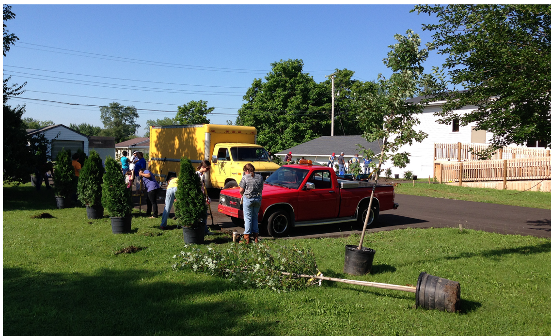
Figure 5. Installation of the vegetation, parking and church access ramp on the east side of the Schaffer Chapel in the Whitely Community in Muncie, Indiana.

Arnstein (1969) notes many different ways in which citizen participation can be incorporated into the planning and development process, and these levels of community participation and involvement can be viewed from low to high in a linear order. As placemaking requires community involvement and participation to occur at some level of decision-making, the lowest rung on Arnstein’s ladder that could be considered a placemaking process is the level of partnership. At this level