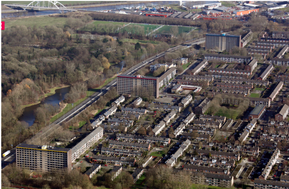
Figure 3. Selwerd seen from above, with three student flats located on the left.

In 2013, a neighbourhood renewal programme commenced in Selwerd and the student lock was abolished in 2015.