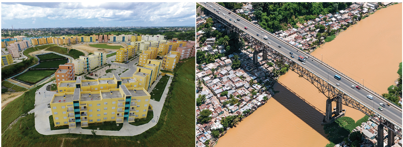
Figure 4. Contrasts between LNB and La Vieja Barquita neighbourhoods.

The LNB project established a precedent of social inclusion and comprehensive approach for urban projects in the country. It also challenged the status quo of the public system in terms of targeting environmentally vulnerable populations (personal interview with Informant 4) and responding with a preventive and permanent solution, contrary to traditional post-events temporary projects. Nevertheless, there are concerns about its limited impact. Particularly, it does not shape a structural path for genuine public policy or new governance approaches; it is just a single project. In fact, LNB is an infrastructural solution, not a "reform process or a transformative endeavour" (personal interview with Informant 2). In contrast, as observed in other countries (especially in Europe), certain modes of governance have a