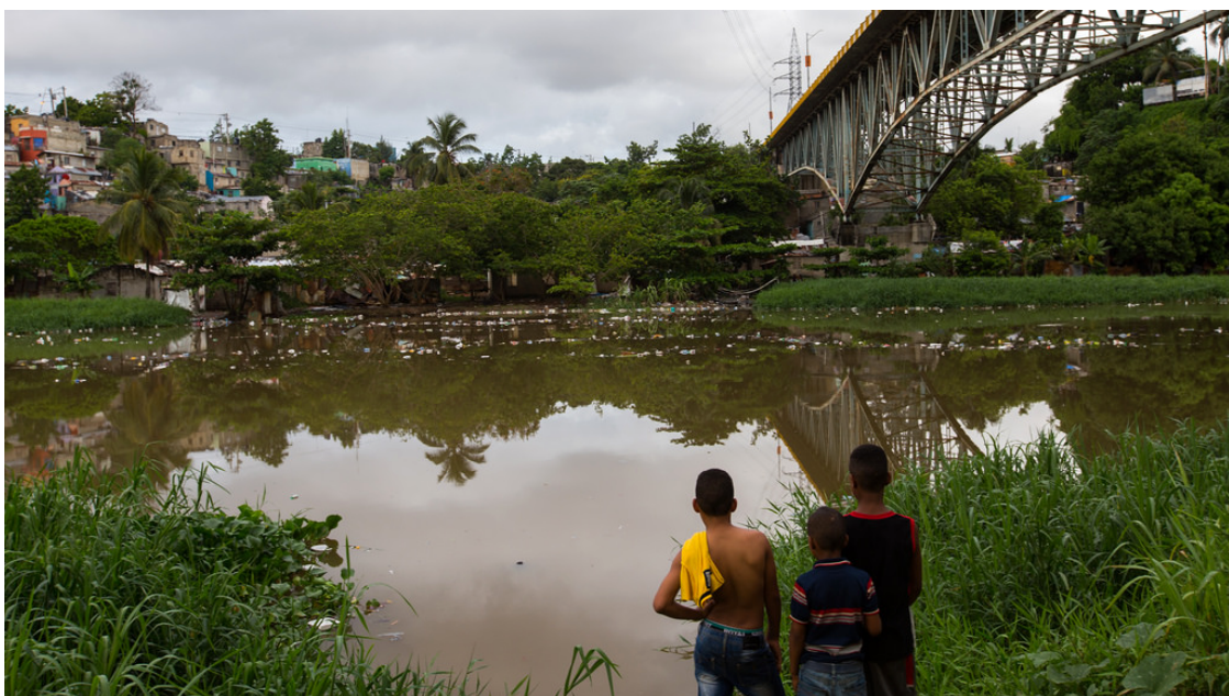
Figure 3. La Vieja Barquita neighbourhood and the Ozama River in Santo Domingo.