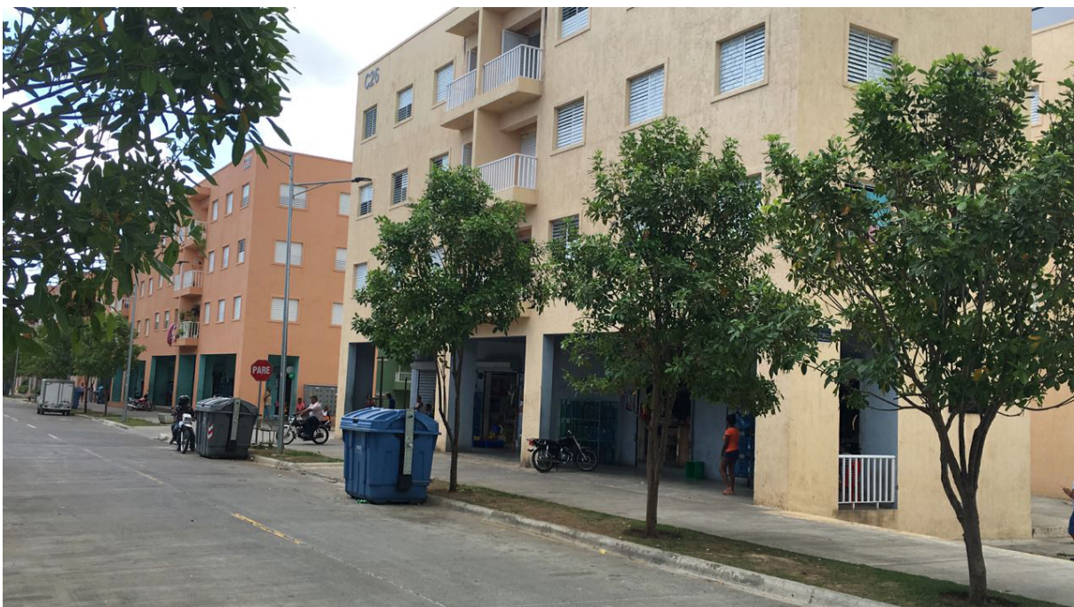
Figure 5. Integrated services in LNB: apartments, businesses, sidewalks, trash collection system, public lighting, and public signs.

In fact, it is likely that if there had been local power from local governments and NGOs, the La Barquita project would have been much more conflictive. This is simply because the Northern Santo Domingo government would not have been happy to receive 1,400 new poor families in its territory without receiving extra financial support from the national government to handle these new families. By comparison, the Eastern Santo Domingo government may have considered it positive to expel part of its population, and in return, receive a brand new ecological park in the formerly deprived riverside areas (personal interview with informant 6). In fact, the Santo Domingo Joint Association, which gathers the main local administrations of the area, was not fully involved in the project, despite its coordination abilities and experiences working in the territories. What is more precise and paradoxical is that the “verticality” of the decision-making process by the central government may have been the reason for the rapid execution of the LNB project.