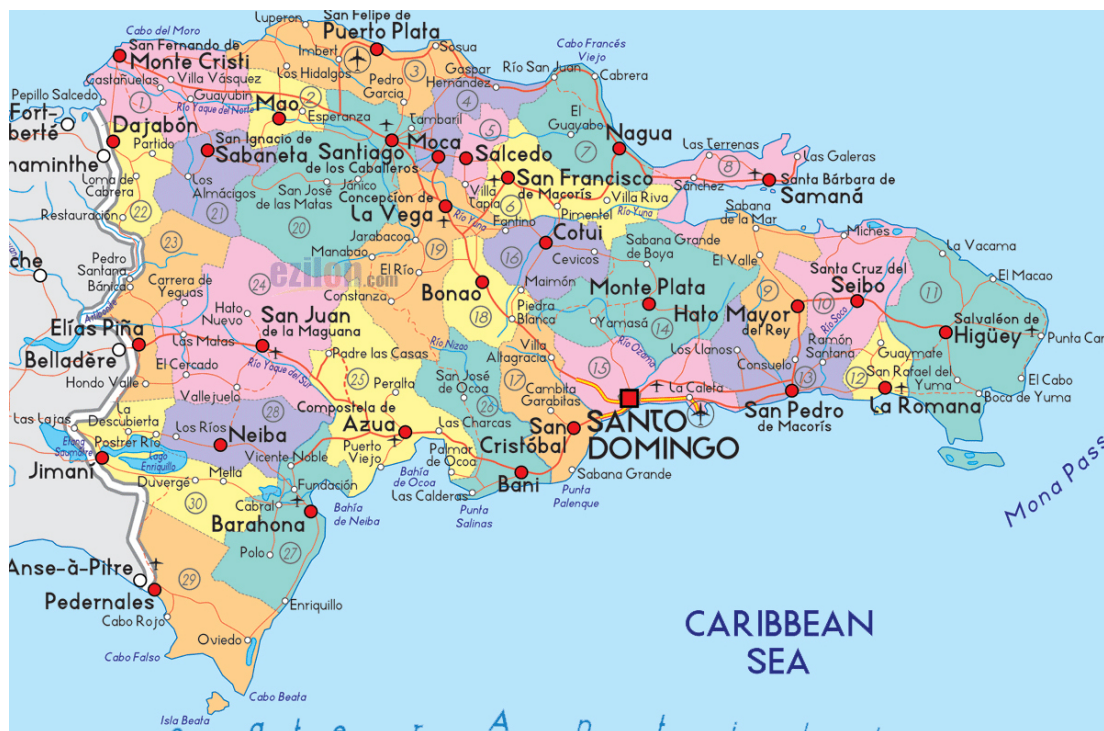
Figure 1. Map Library of the Dominican Republic: the Dominican Republic and Santo Domingo.

The focal problem of the municipality is the incapacity of the local governments to transform their environment and become an active territorial development agent (Domenella et al., 2017); local governments are therefore unable to undertake major urban transformation projects that may affect social and economic structures and dynamics in cities. Within this centralised governance scheme, their limited autonomy is confirmed by the fact that traditionally local taxes such as the real estate property tax are collected by the national tax authority, as well as by the inability of municipalities to borrow financial resources, internally or abroad, without permission of the central government. In terms of transparency, allegations of corruption are frequent in local administrations, as well as the misuse of funds. Concerning capacities, there is a lack of soft capacities in terms of technical skills, management, planning, and professionalization of human talent; and when it comes to hard capacities, they fall short of all types of resources. Looking at the financial aspects, 75% of the resources of municipalities come from central government transfers; and of the 10% of the