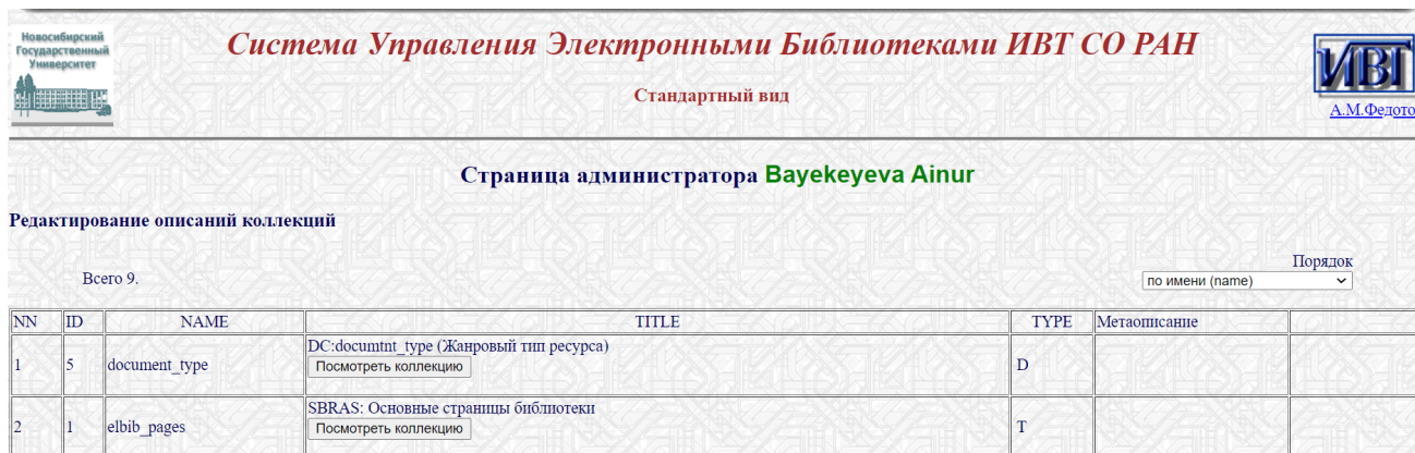
Figure 1. Homepage of the website Control System for Digital Libraries of the Institute of Computational Technology of the SB RAS.