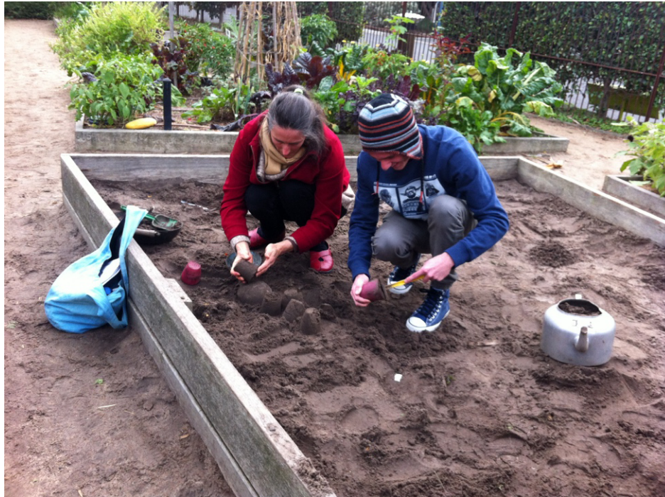
Figure 1. Students learning how to play at the Ian Potter Foundation’s Children’s Garden.