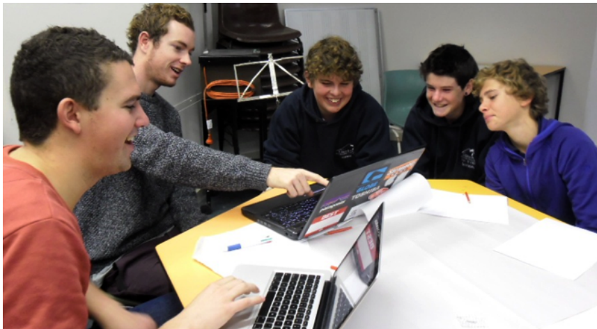
Figure 4. School students visit the university for the project. (Image by Marion Drummond, 2012).

lives too... (CL, female postgraduate, Mediterranean heritage, Australia)