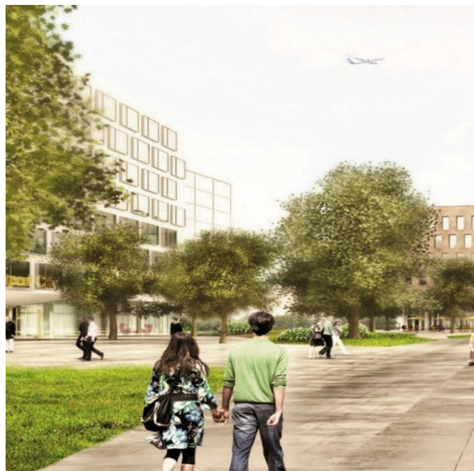
Figure 3. Sector Cointrin West, horizon 2030.

Conversely, among the public described as distant from the “contemporary architecture” recommended for the collective housing likely to be developed in the area, mention is made to the “classic middle class,” which “tends to favour individual or terraced houses with densities [that] are probably lower than the objectives,” the “upper-middle class,” who “want and prefer to live in detached houses located in luxury districts,” and even the “traditional rural population,” whom the site is hopefully “too urban to attract, as they aspire above all to live in the countryside” (DALE, 2015, p. 76). Undoubtedly, the “urban development model” (as it is often called) advocated in this urban project conveys an aesthetic model which is not socially neutral (Figure 3). The imagined new district is perceived as not only expected but