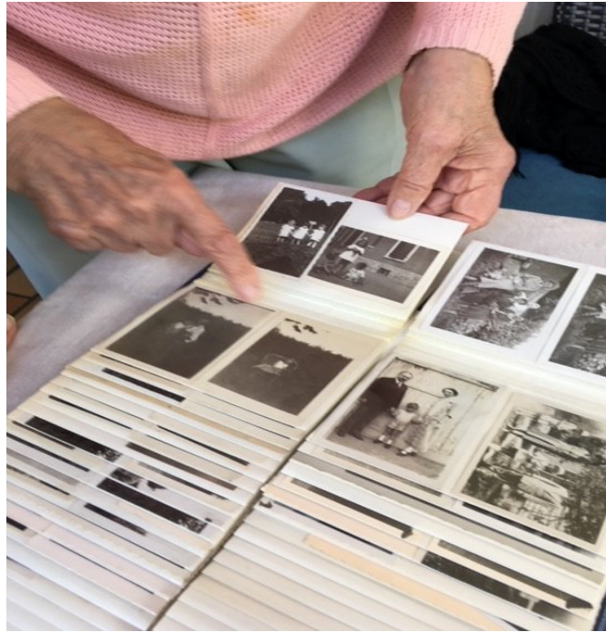
Figure 4. Family album of a resident of the Cointrin area, 2019.

p. 209); there is the feeling of controlling one's own space, "which is not the same as being in a flat" (Thomas, 2013, p. 394).