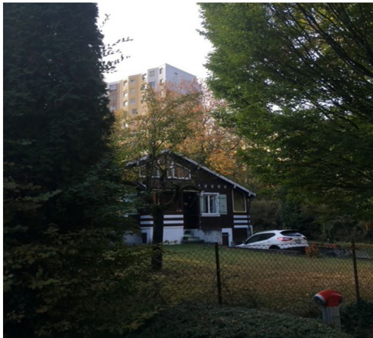
Figure 5. The adjacent neighbourhood: Social housing in the Avanchets district, 2019.

Some arguments in support of the housing estate are also based on its “green” character. A banner in Cointrin, as published in Pic-Vert , read: “People in towns also need green spaces. No to office blocks” (“Modification de zones,” 2016, p. 18).