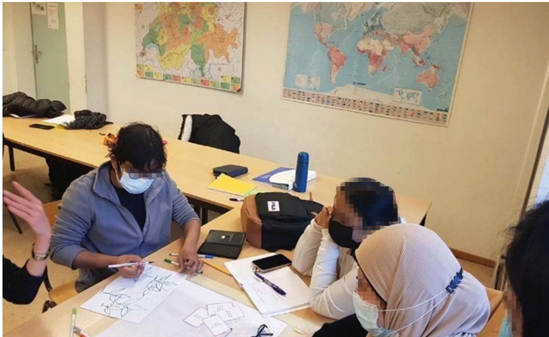
Figure 1. Facilitating the description of everyday places.

The following extracts emerged from the prompt “What heroic figure(s) live(s) in this area?”