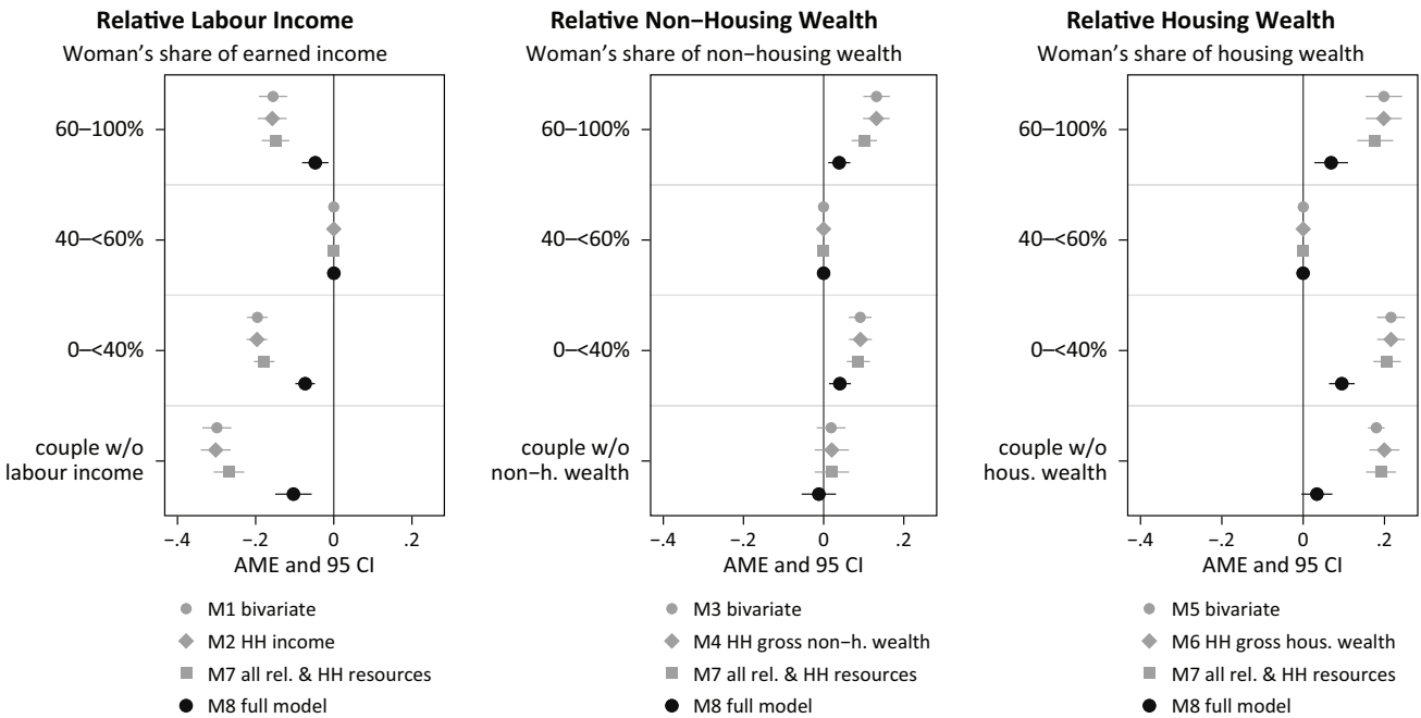
Figure 2. AME for independent money management. Notes: Logistic regression with robust standard errors; controlled for net household income, couple's total gross non-housing and housing wealth, total couple debts, marital status, children, couple duration, East German/West German/mixed socialization, woman's qualification, man's qualification, man's age, age difference between partners, survey year; based on SOEP v36; multiply imputed data; unweighted; N = 8874 couples.

Concerning wealth, we anticipated the opposite—we expected that an equal distribution between the partners would make the pooling system more likely, while within-couple wealth inequality would increase the probability of the independent management system (H2). Again, the results supported this assumption. The middle panel of Figure 2 shows that an unequal distribution of non-housing wealth within couples increased the probability of independent money management by about four percentage points, irrespective of whether the women possessed less or more than the male partner (model M8). For housing wealth, this association was even stronger (right panel of Figure 2). If women had a lower share of housing wealth than their partner, this increased the probability of employing an independent management system by 10 percentage points compared to couples with a certain degree of equality in non-housing wealth (model M8). If women owned more housing wealth than their partners, the probability was seven percentage points higher. Again, both associations