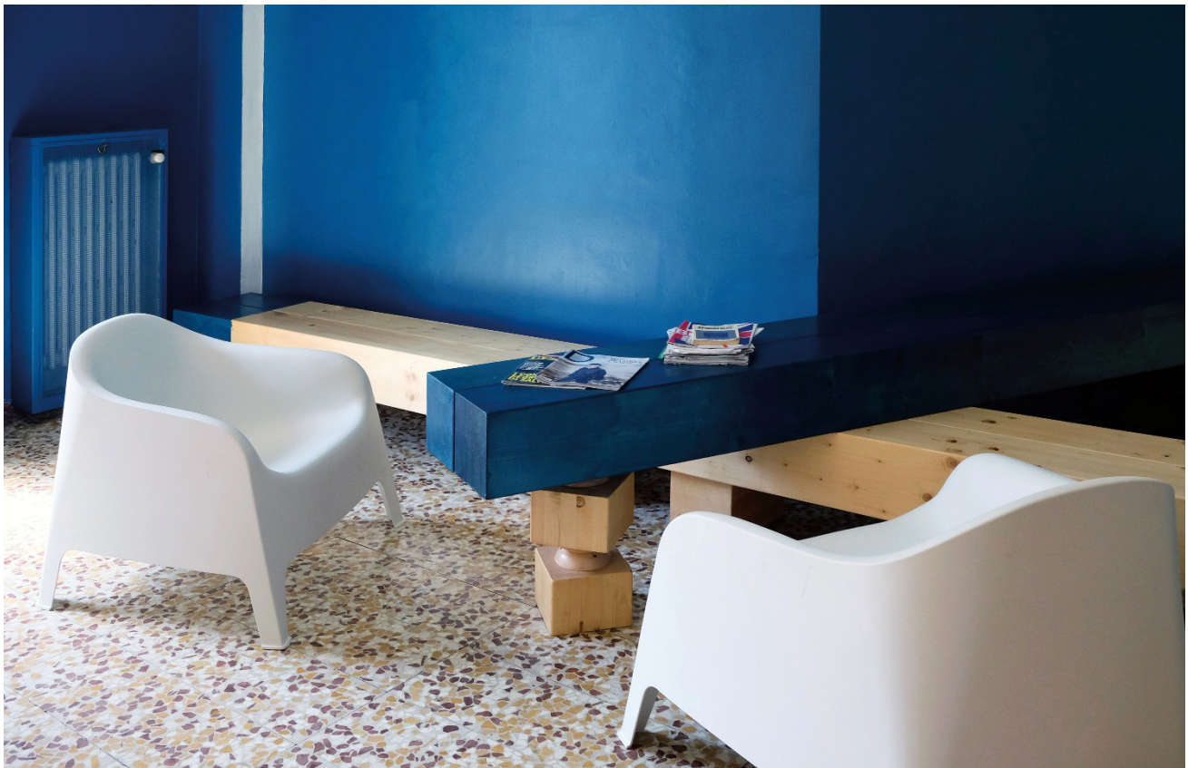
Figure 2. Cartoons corner: A co-designed and co-produced lounge for project Cantiere Mambretti (copyright Daniele Lazzaretto, Lilithphoto). Source: Campagnaro and Di Prima (2018a, p. 15).

The co-design process starts with a collective exploratory tour of the venue and is driven by a cycle of focus groups and design sessions with hosts and social and care operators in order to, first, understand the critical issues to be faced, and then to agree on solutions to be developed. Then, the group takes part in the making practices, i.e., furniture building, wall painting, setting up of wayfinding and signage systems (Figure 2). Cantiere Mambretti generates a sort of temporary "creative revolution" within the shelters in which all participants can have a voice and bring their help and competences (Campagnaro, Di Prima, & Ceraolo, 2018). The vibrant atmosphere of the workshop affects the reception service's routines, reverses roles, and creates a positive impact by giving value to participants' skills and aspirations. The effects of this designing together depend on the participants. As regards the experience of immigrants and the homeless, the participation generates their feeling of being active users and recognised