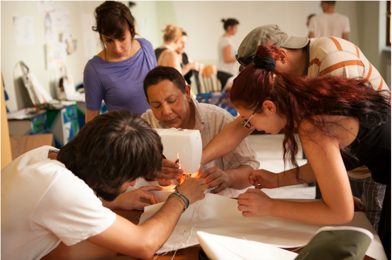
Figure 3. Sewing workshop: Citizens, both experiencing homelessness and otherwise, are sewing together during a “Costruire Bellezza” workshop.

with newness, and new nodes of network releasing from the isolation of homelessness (Campagnaro & Ceraolo, 2020; Petrova & Campagnaro, 2017; Porcellana & Campagnaro, 2019a).