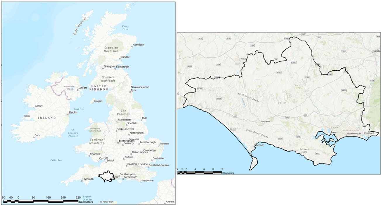
Figure 2. Location of West Dorset, United Kingdom.