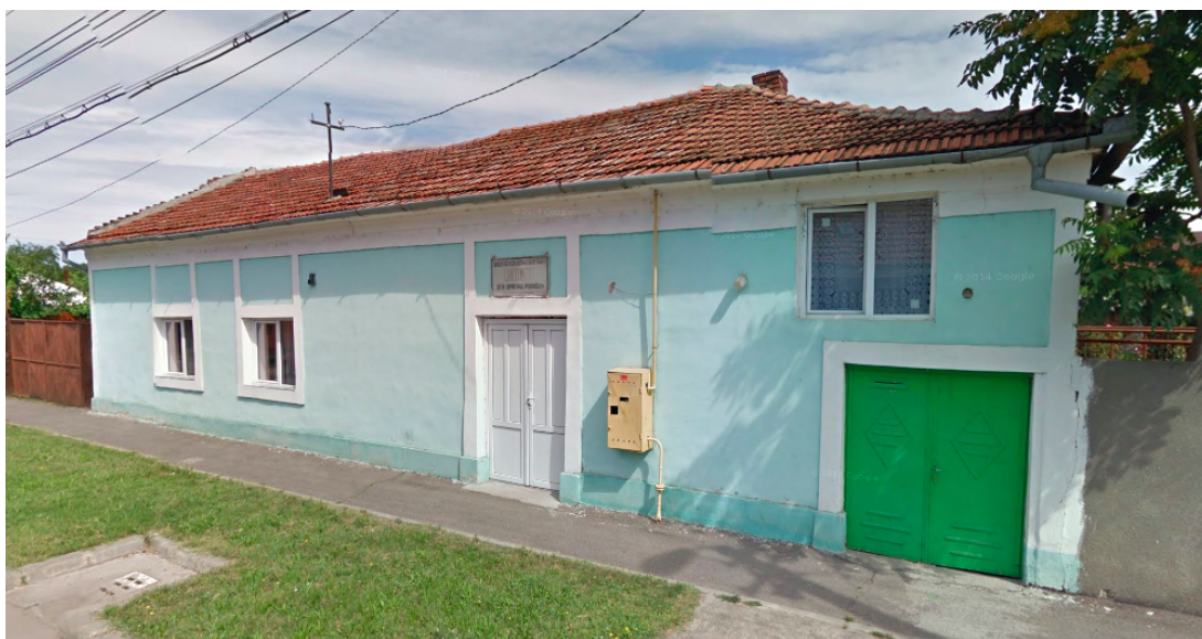
Figure 3. Faith Church in Arad-Sega in 2014.