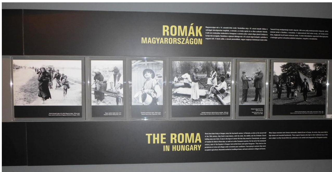
Figure 4. The Roma section in the introductory room of the Holocaust Memorial Center in Budapest.

"By the end of the nineteenth century, most of the Gypsies in Hungary had settled down and spoke Hungarian. They lived on the peripheries of cities and villages under extremely poor conditions. From spring to autumn they were occupied in agriculture; thousands worked as travelling artisans, and were welcome in villages and towns. Many Gypsy musicians were famous nationwide, indeed all over Europe. As artists, they were held in high esteem and rewarded handsomely. Those vagrant Gypsies who kept to their traditional way of life were subject to often forced efforts by authorities to be settled and integrated into Hungarian society."