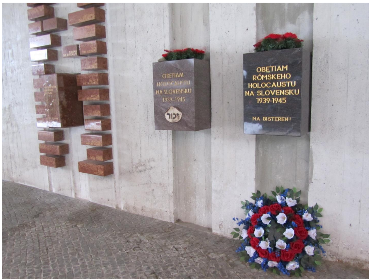
Figure 1. Roma memorial at the Museum of Slovak National Uprising (2006), Banská Bystrica.

For the first time, however, the museum also provides detailed information about Roma victims and their not only German, but also Slovak perpetrators on the first page of the Roma section on the info-screens: