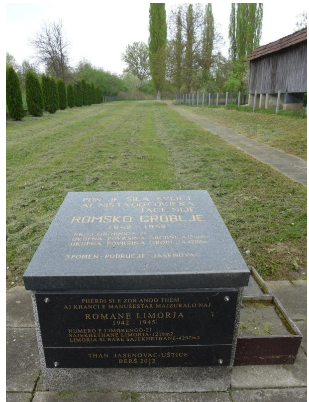
Figure 3. Memorial at the site of the former “Gypsy camp” Uštica, part of the Jasenovac Memorial Site, Croatia.