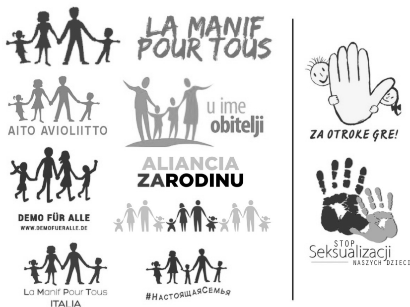
Figure 1. Logos of anti-gender campaigns in Europe (Kuhar & Paternotte, 2017, p. 269).

“Gender ideology”, or even more so “gender theory”, should not be confused with the scholarship developed in the field of gender studies, but is a term initially created to oppose women’s and LGBT rights activism as well as the scholarship deconstructing essentialist and naturalistic assumptions about gender and sexuality. Erasing fierce controversies within gender and sexuality studies and the complex interplay between activism and the academy, it operates as a powerful interpretive frame. According to its opponents, “gender ideology” is the ideological matrix of the different reforms they try to oppose, which pertain to intimate/sexual citizenship debates, including LGBT rights, reproductive rights, and sex and gender education.