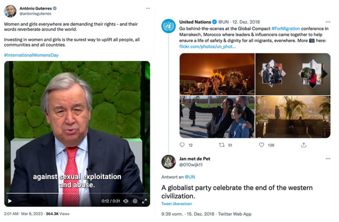
Figure 2. Two tweets from UN handles. Note: All tweets are archived and searchable at Wayback Machine (https://web.archive.org). Sources: Guterres (2019); Jan met de Pet (2018).