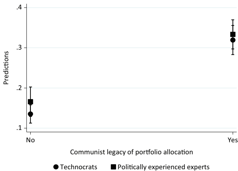
Figure 3. Adjusted predictions for the effect of communist portfolio allocation on the predicted proportion of experts (with 95% CIs). Note: Based on Models 1 and 2, all covariates are set at means.

Finally, following the communist legacy argument, one may expect that the appointments of experts to policy areas, which were dominated by experts during the communism, are rationally motivated by the increased demand for expert knowledge for performing in this portfolio. The source for this demand could be the PM, the president, public opinion, or external circumstances (like economic crisis). Therefore, technocrats will