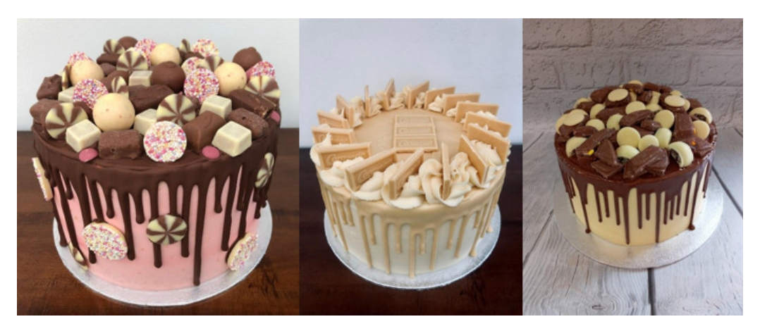
Figure 1. Drip cakes by a follower of Cupcake Jemma (R. Winfield, personal communication, 2024).

baking communities, in the first episode of the popular amateur TV baking competition Great British Bake-Off in 2023 (UK, Channel 4), every one of the diverse cohort chose to make one—the drip cake is a new "classic."