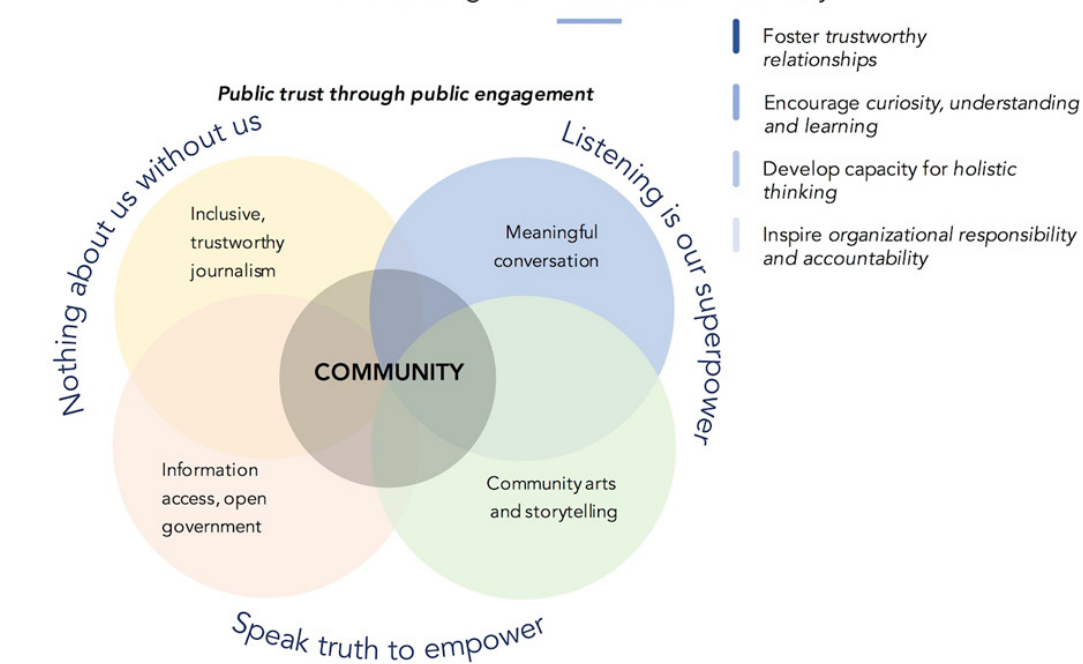
Figure 2. The Journalism That Matters civic communications framework.