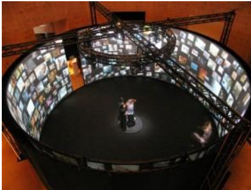
Figure 1. T-visionarium , International Documentary Film Festival Amsterdam, 2009.

Such developments do not at all signal the ‘end of’ linear forms of storytelling via television, but rather such forms of storytelling are opened up by the access to digitalised archival collections and are further expanded through interactive experiences for users. A specific case study in the context outlined above is After the Liberation , a particular example of enriching archive-based programming through cross-media practices.