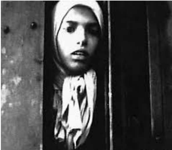
Figure 5. The iconic image of Settela Steinbach from Breslauer's Westerbork film. Her name was only discovered in 1994 after thorough research by a journalist and historians of Herinneringscentrum Kamp Westerbork (Wagenaar, 1995). Source: Netherlands Institute for Sound and Vision.

Here, the 'Droste-effect of archiving' also comes into play. Generally speaking, the 'Droste-effect' (the name is derived from a picture appearing within itself on the tins of Dutch cocoa powder brand Droste) refers to the effect of a mise en abyme , or an image appearing within itself. We use the notion 'Droste-effect of archiving' to problematize the increasing amounts of original material already being preserved in the archive, which in turn are re-used, re-contextualised and archived in television broadcasts, and in addition are made available online, usually in again a different re-contextualisation—forming a multi-platform and hybrid 'repertoire' of memory (see also Hagedoorn, 2013). This includes new forms of the re-screening of previously broadcast materials in online and on-demand contexts—for example, The Wonder Years (ABC, 1988–1993) being repeated and reviewed via the on-demand streaming service Netflix, but with many of the originally included songs being replaced due to licencing issues.