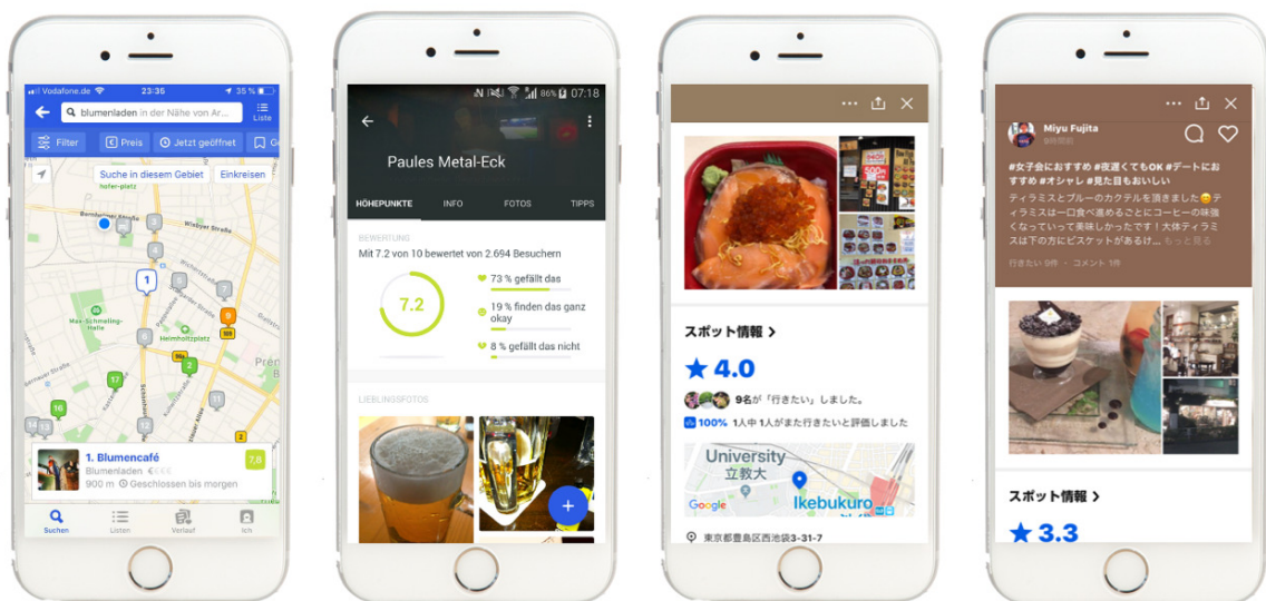
Figure 2. Screenshots of Foursquare City Guide (left) and Tabelog (right) captured in our interviewees’ media diaries.

A:... At Berlin Hauptbahnhof, I will not write a tip. Except maybe....I think I once wrote a tip because at some point... that may not be the case anymore, but in the past, you hardly found any lockers in the main hall or they were all occupied.