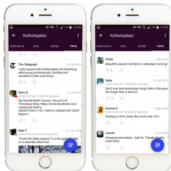
Figure 3. Berlin's Kollwitzplatz through the lens of Foursquare City Guide. Note: screenshots captured during our case study.

Since the more elaborated knowledge required to understand what is going on at locations restricts their perceived accessibility, the question arises whether the information shared by users of recommendation apps can reduce these barriers to perceived accessibility. Although users can search for all kinds of places in their surrounding areas, including those different from their usual habitat, our interviews show that this kind of search is rare. The main motivation to use recommendation apps seems to be to find additional places that fit existing preferences rather than to explore unknown territory. Instead of the internalized psychological filters Milgram (1970) or Simmel (1950) have attested to urbanites, users of recommendation apps allow external technical filters to relieve them of the cognitive overload of potentially accessible places. The various filtering features of Foursquare and Tabelog make it possible for users to exclude from searches most kinds of places and